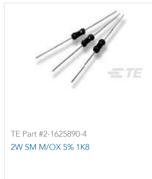
TE Part #2-1625890-4 2W SM M/OX 5% 1K8