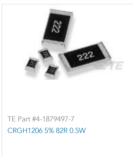
TE Part #4-1879497-7 CRGH1206 5% 82R 0.5W