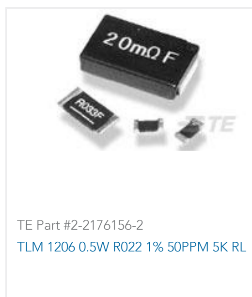
TE Part #2-2176156-2 TLM 1206 0.5W R022 1% 50PPM 5K RL