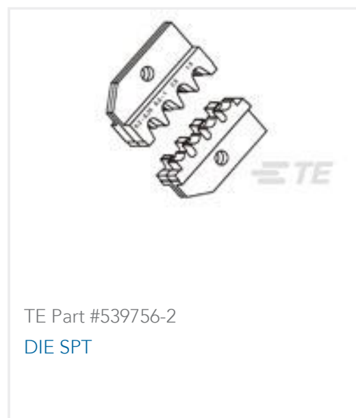
TE Part #539756-2 DIE SPT