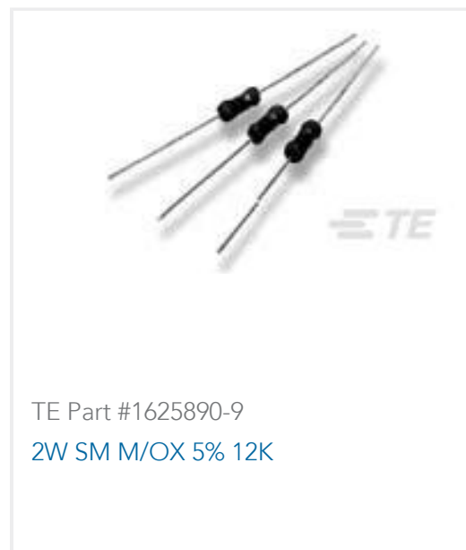
TE Part #1625890-9 2W SM M/OX 5% 12K