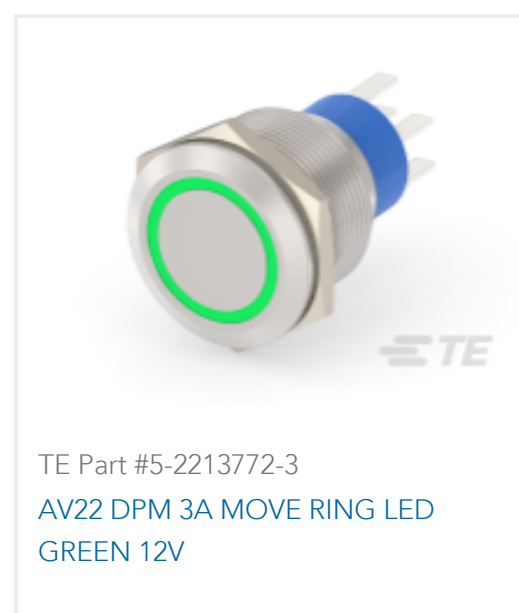
TE Part #5-2213772-3 AV22 DPM 3A MOVE RING LED GREEN 12V