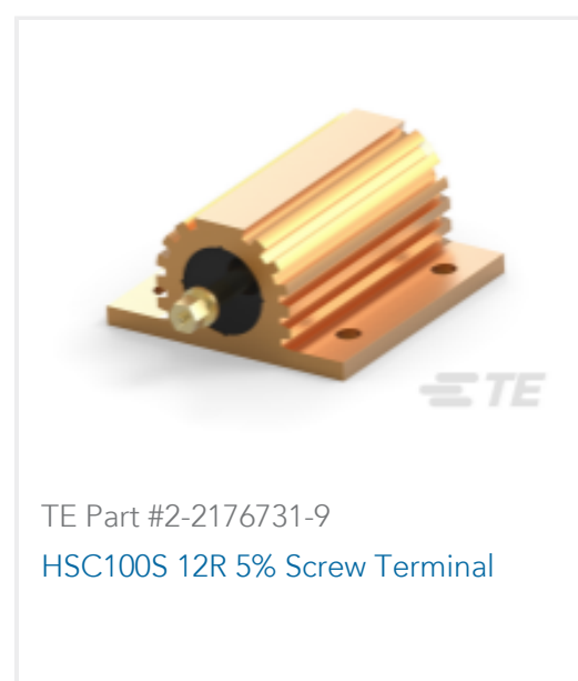
TE Part #2-2176731-9 HSC100S 12R 5% Screw Terminal