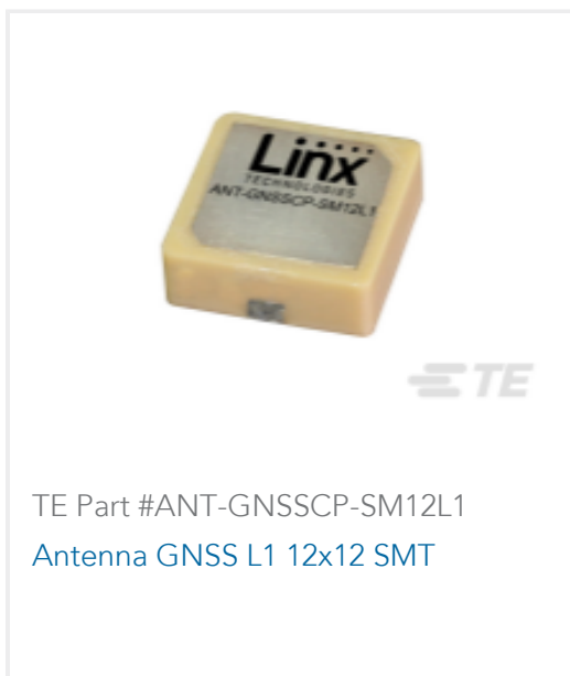
TE Part #ANT-GNSSCP-SM12L1 Antenna GNSS L1 12x12 SMT