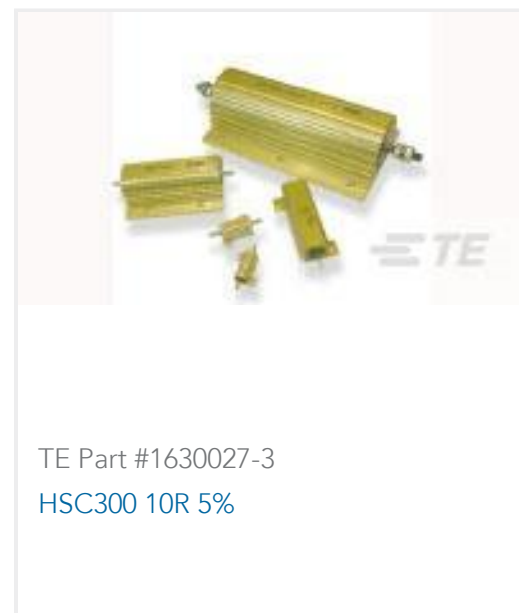
TE Part #1630027-3 HSC300 10R 5%