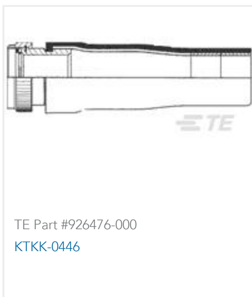
TE Part #926476-000 KTKK-0446