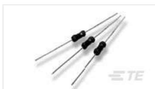
TE Part #4-1625890-1 2W SM M/OX 5% 330R