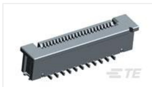
TE Part #1734742-8 .5 FPC VT ZIF Type-A 8 CONT