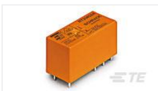
TE Part #1-1393243-1 RTE24048