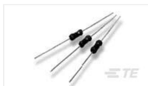
TE Part #7-1625890-0 2W SM M/OX 5% 82K