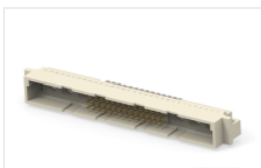
TE Part #374162-E STVM 42-6 M ABC VV 4-00 0606 ** 247 E0