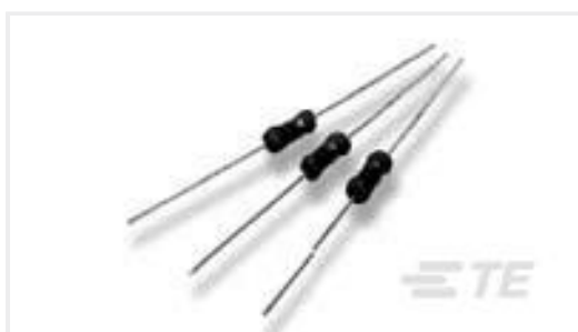
TE Part #5-1625892-9 3W SM M/OX 5% 56K