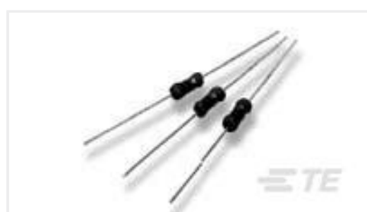
TE Part #4-1625890-2 2W SM M/OX 5% 33K