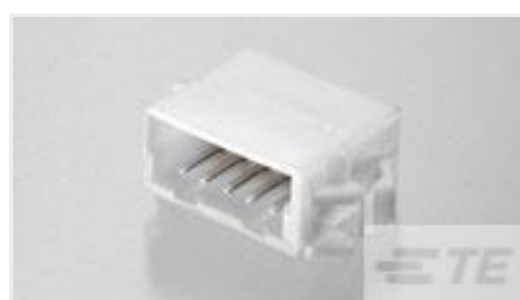
TE Part #292254-5 CT RELAY HDR ASSY 5P NAT