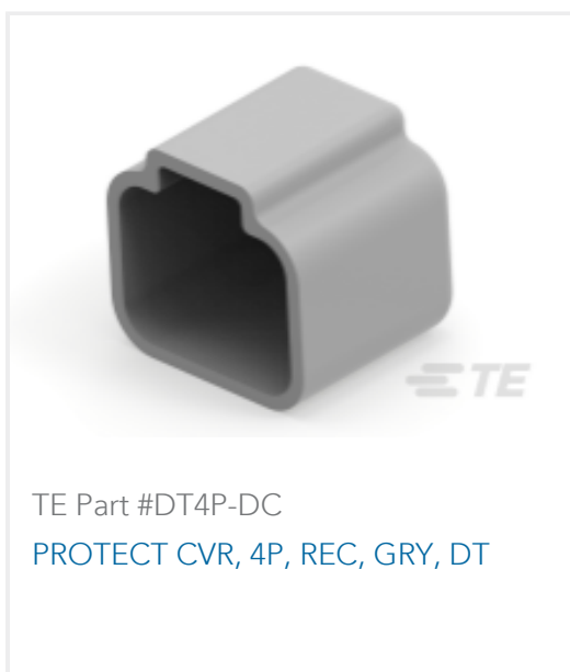
TE Part #DT4P-DC PROTECT CVR, 4P, REC, GRY, DT