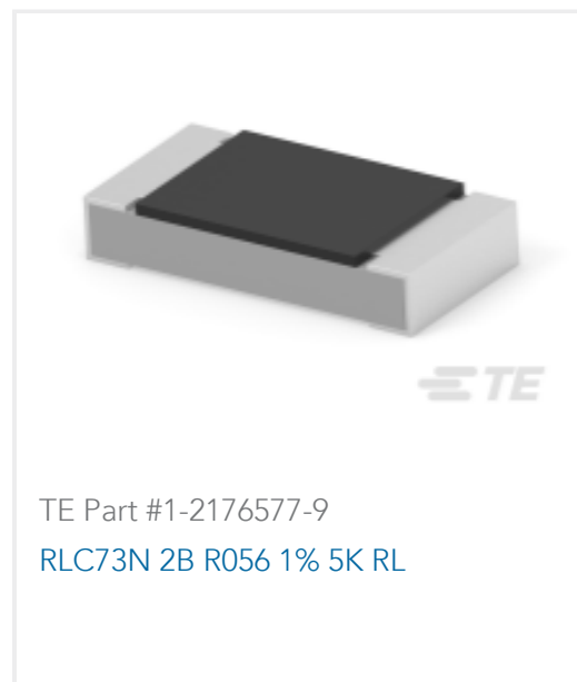
TE Part #1-2176577-9 RLC73N 2B R056 1% 5K RL