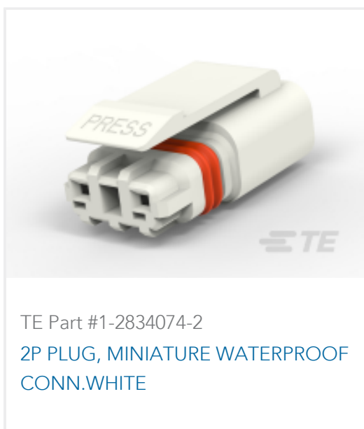
TE Part #1-2834074-2 2P PLUG, MINIATURE WATERPROOF CONN.WHITE