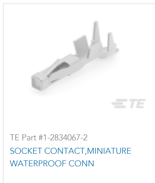
TE Part #1-2834067-2 SOCKET CONTACT,MINIATURE WATERPROOF CONN