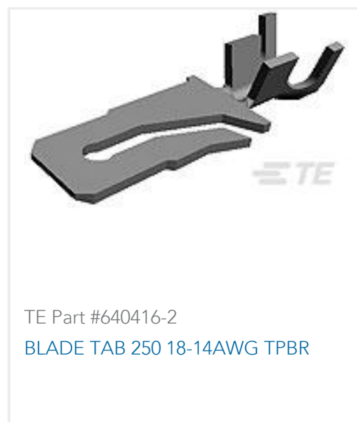
TE Part #640416-2 BLADE TAB 250 18-14AWG TPBR