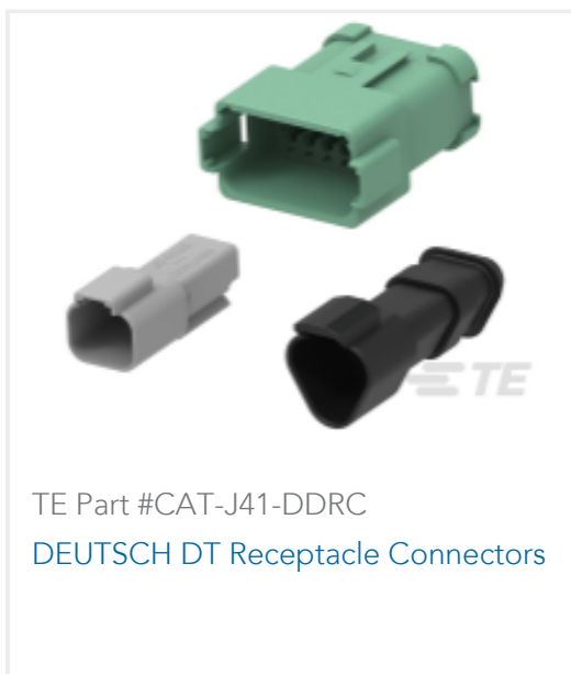
TE Part #CAT-J41-DDRC DEUTSCH DT Receptacle Connectors