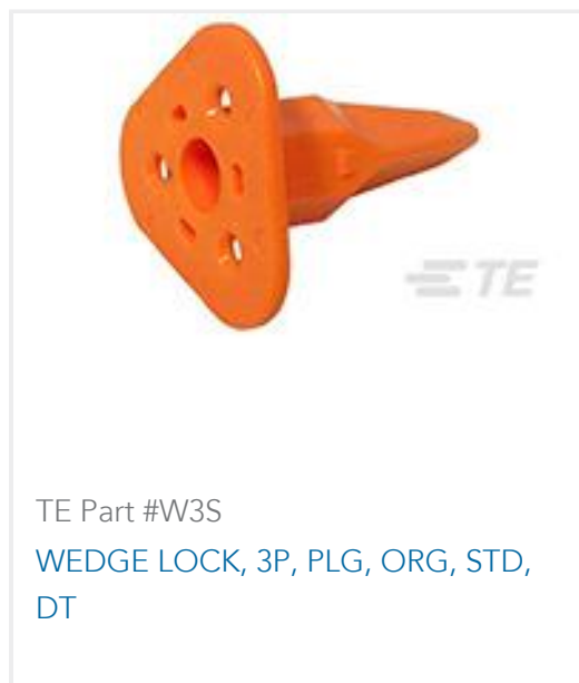
TE Part #W3S WEDGE LOCK, 3P, PLG, ORG, STD, DT