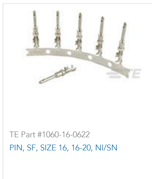
TE Part #1060-16-0622 PIN, SF, SIZE 16, 16-20, NI/SN