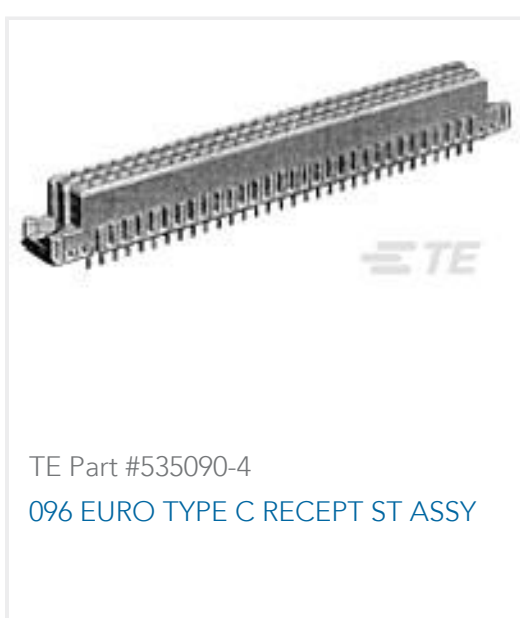
TE Part #535090-4 09% EURO TYPE C RECEPT ST ASSY