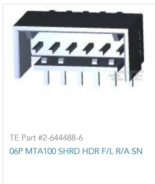
TE Part #2-644488-6 06P MTA100 SHRD HDR F/L R/A SN