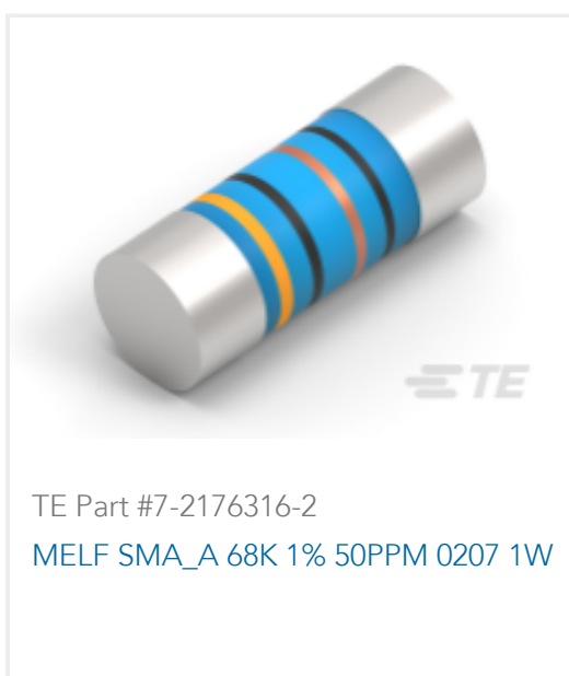
TE Part #7-2176316-2 MELF SMA_A 68K 1% 50PPM 0207 1W