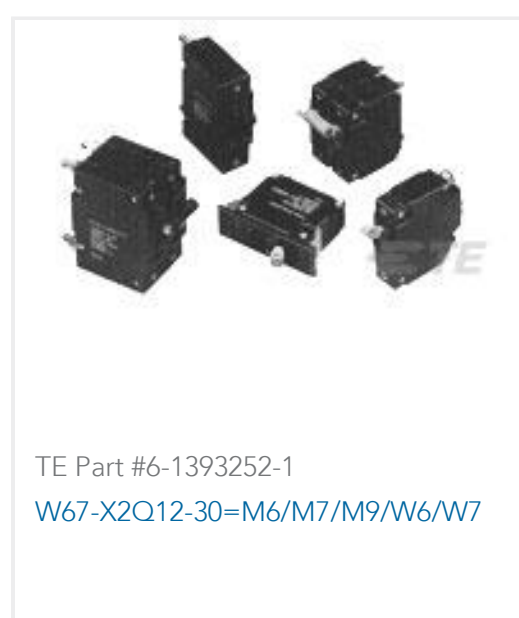
TE Part #6-1393252-1 W67-X2Q12-30=M6/M7/M9/W6/W7