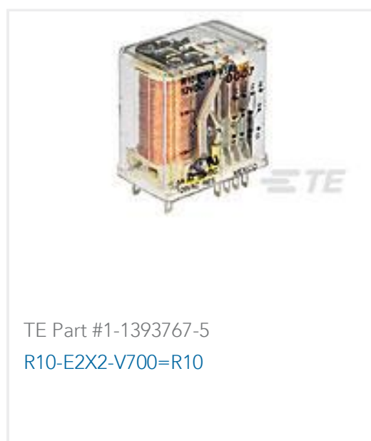
TE Part #1-1393767-5 R10-E2X2-V700=R10