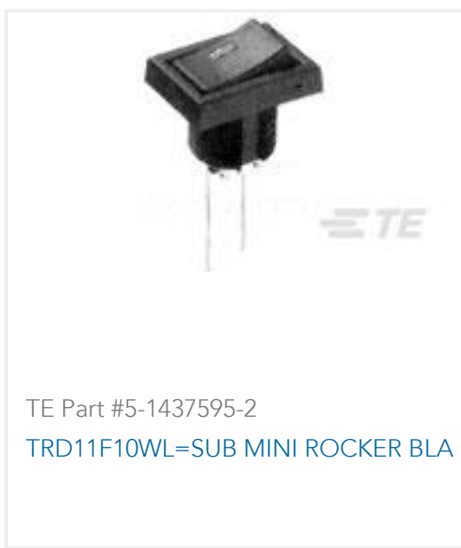
TE Part #5-1437595-2 TRD11F10WL=SUB MINI ROCKER BLA