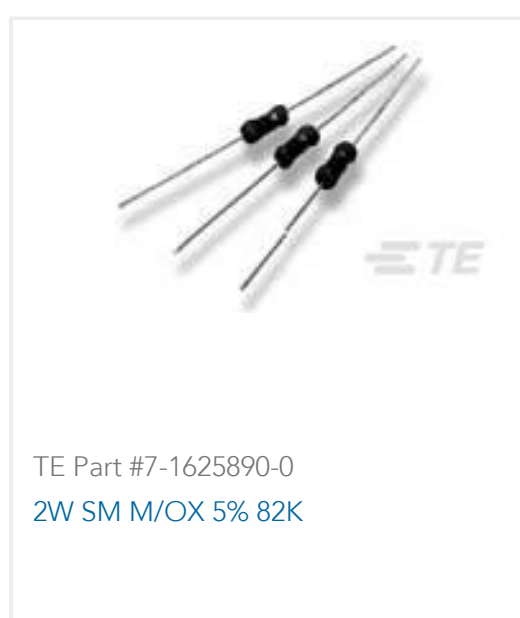
TE Part #7-1625890-0 2W SM M/OX 5% 82K