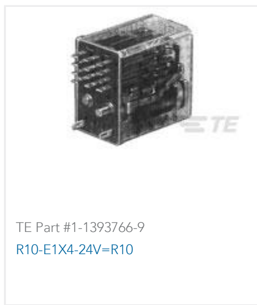
TE Part #1-1393766-9 R10-E1X4-24V=R10