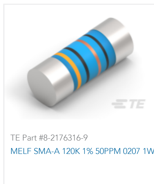
TE Part #8-2176316-9 MELF SMA-A 120K 1% 50PPM 0207 1W