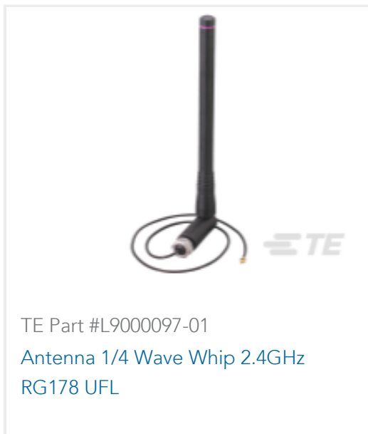
TE Part #L9000097-01 Antenna 1/4 Wave Whip 2.4GHz RG178 UFL