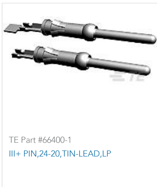
TE Part #66400-1 III+ PIN,24-20,TIN-LEAD,LP