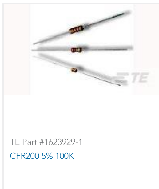
TE Part #1623929-1 CFR200 5% 100K