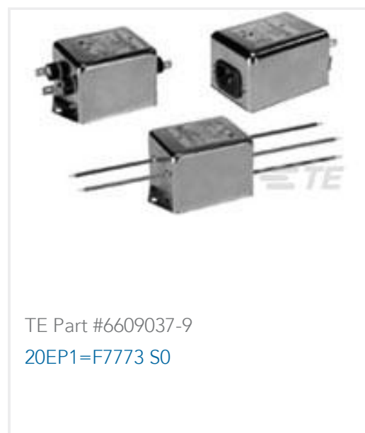
TE Part #6609037-9 20EP1=F7773 S0