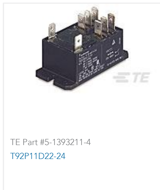
TE Part #5-1393211-4 T92P11D22-24