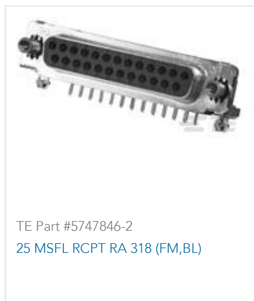
TE Part #5747846-2 25 MSFL RCPT RA 318 (FM,BL)