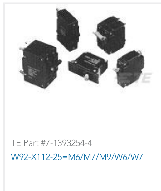
TE Part #7-1393254-4 W92-X112-25=M6/M7/M9/W6/W7