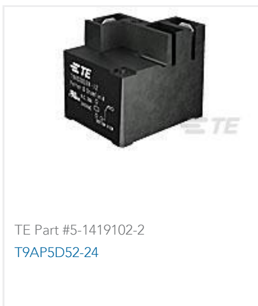
TE Part #5-1419102-2 T9AP5D52-24