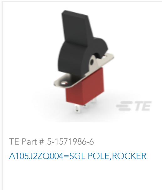
TE Part # 5-1571986-6 A105J2ZQ004=SGL POLE,ROCKER