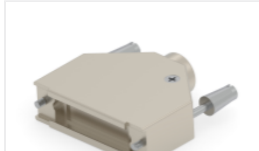
TE Part #5-2198617-3 Pltd Plastic Backshell 25 way Str, KIT