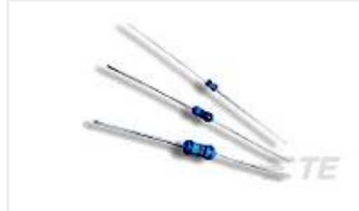
TE Part #2-1879026-7 YR1 0.1% 18R2