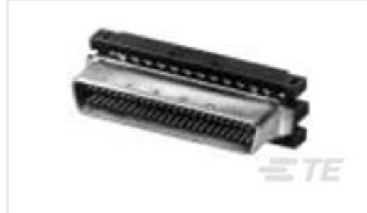
TE Part #749621-8 80 50S CABLE PLUG CONN/COV KIT