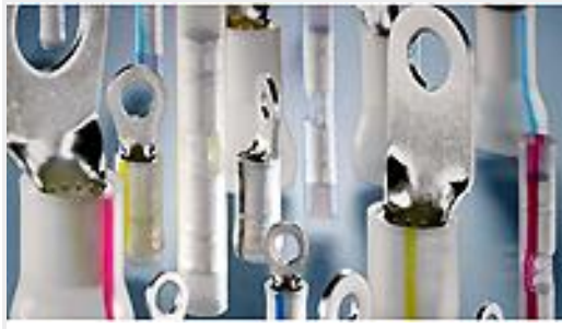
TE Part #53428-1 TERMINAL,PIDG PVF2 R 12-10 3/8