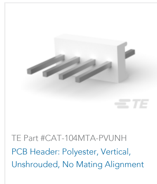
TE Part #CAT-104MTA-PVUNH PCB Header: Polyester, Vertical, Unshrouded, No Mating Alignment