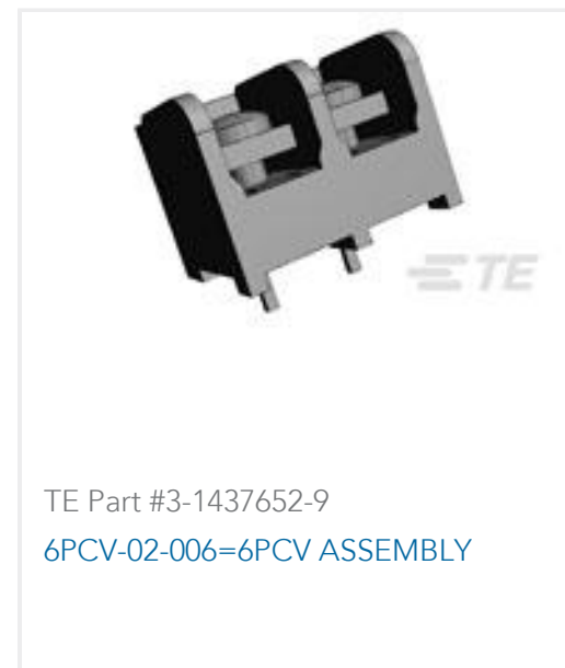
TE Part #3-1437652-9 6PCV-02-006=6PCV ASSEMBLY