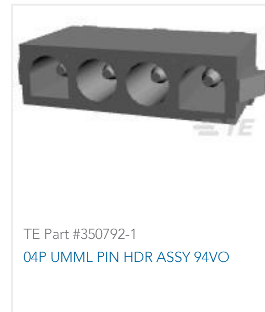
TE Part #350792-1 04P UMML PIN HDR ASSY 94VO