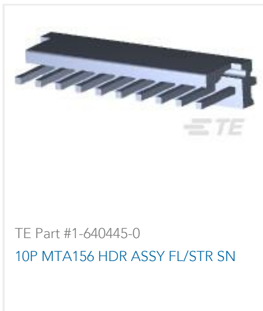
TE Part #1-640445-0 10P MTA156 HDR ASSY FL/STR SN