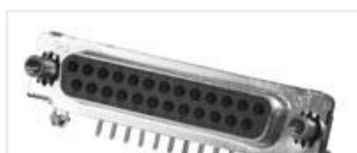
TE Part #5745781-4 09 MSFL RCPT RA 318 (IN,FM)