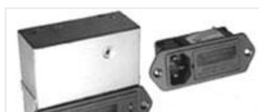
TE Part #3-6609128-0 6VM2=F8098