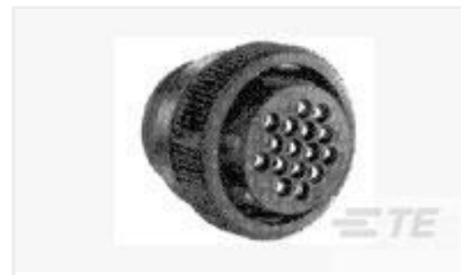
TE Part #206837-3 CPC PLUG ASSEMBLY SIZE 23-24