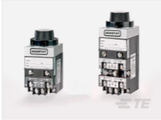
TE Part # 1423157-5 7012AC=RLY,STD,ON,2P,120VAC,15