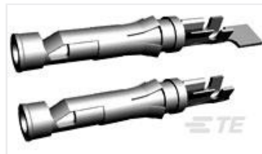
TE Part #1-66101-9 III+ SKT,18-16,TIN,LP