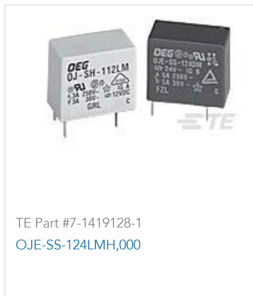
TE Part #7-1419128-1 OJE-SS-124LMH,000