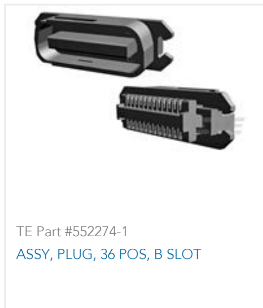
TE Part #552274-1 ASSY, PLUG, 36 POS, B SLOT