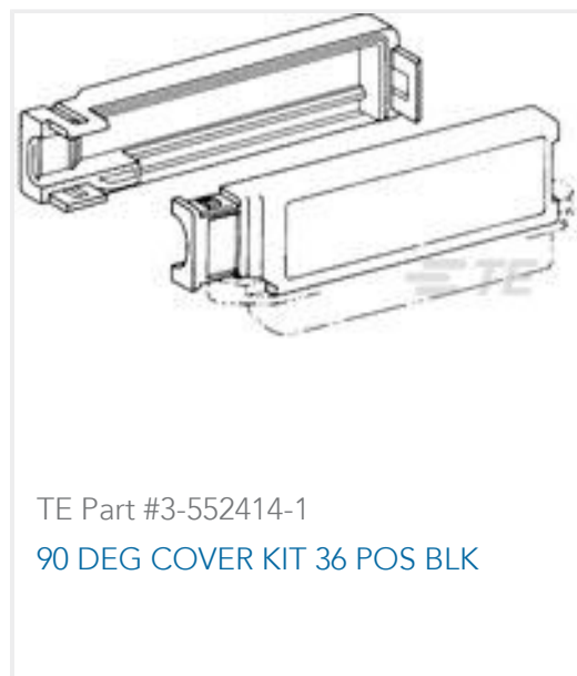
TE Part #3-552414-1 90 DEG COVER KIT 36 POS BLK