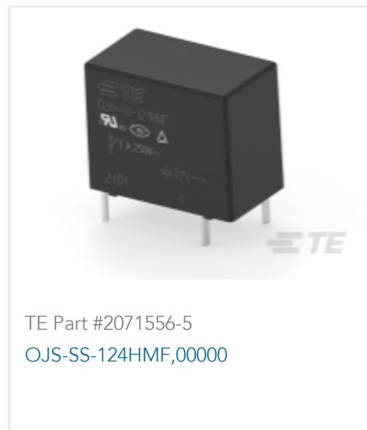
TE Part #2071556-5 OJS-SS-124HMF,00000