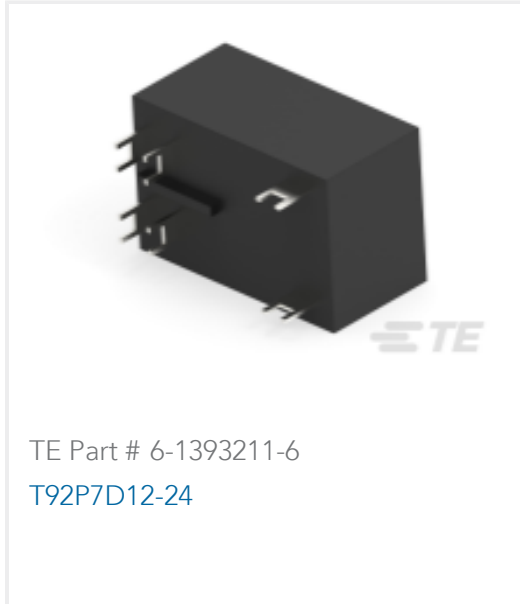
TE Part # 6-1393211-6 T92P7D12-24