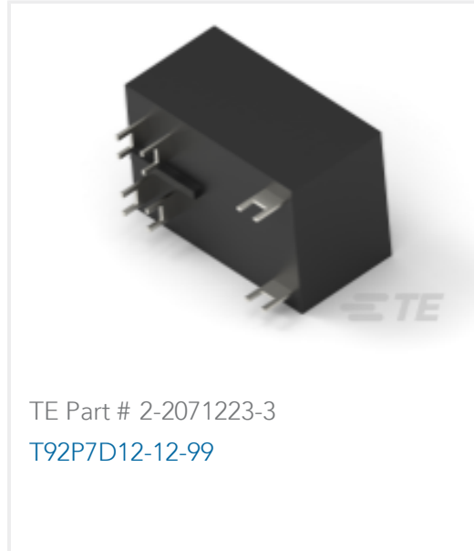
TE Part # 2-2071223-3 T92P7D12-12-99