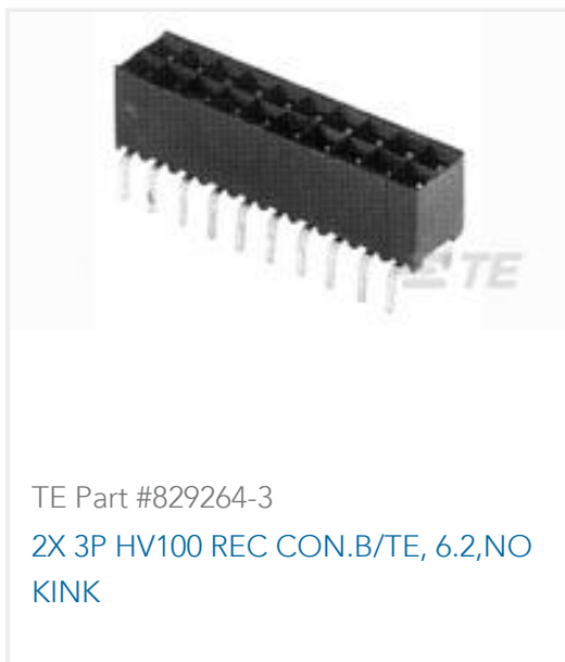
TE Part #829264-3 2X 3P HV100 REC CON.B/TE, 6.2,NO KINK