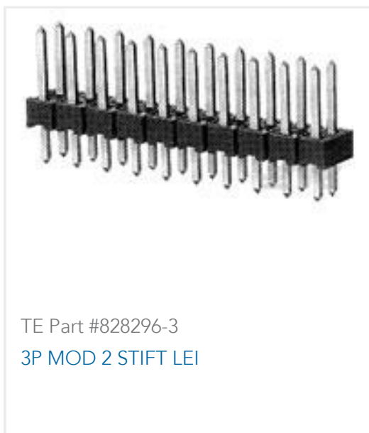
TE Part #828296-3 3P MOD 2 STIFT LEI