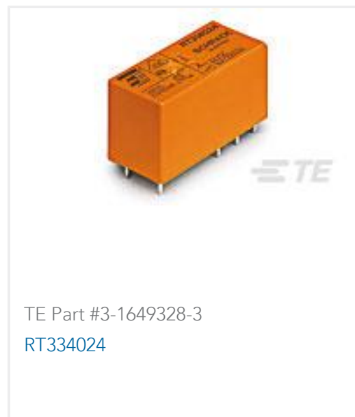
TE Part #3-1649328-3 RT334024