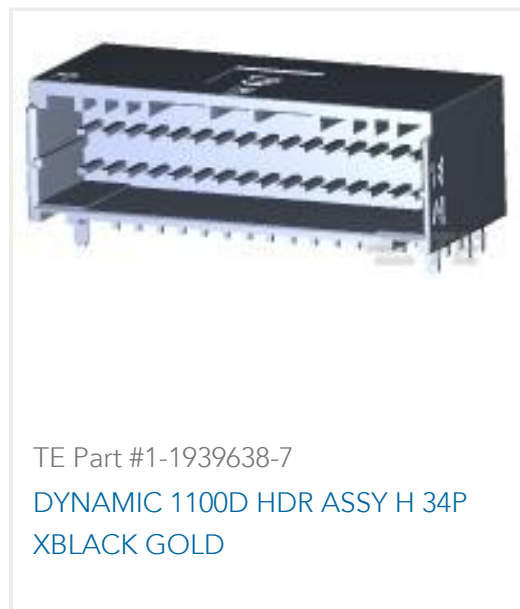
TE Part #1-1939638-7 DYNAMIC 1100D HDR ASSY H 34P XBLACK GOLD