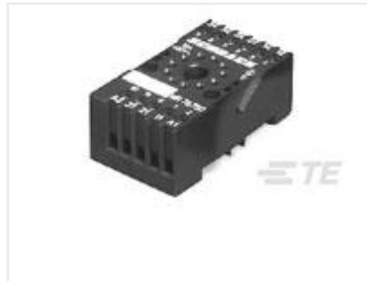
TE Part #1415035-1 MT78750