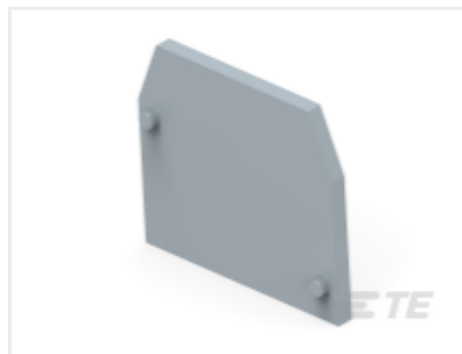
TE Part #1SNA118368R1600 FEM6