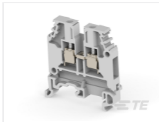
TE Part #1SNA115116R0700 M4/6