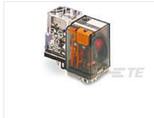
TE Part #8-1393091-4 MT323024