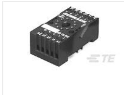
TE Part #3-1415035-1 MT78755