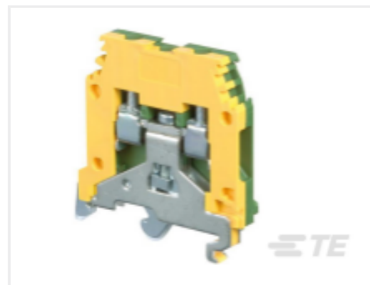
TE Part #1SNA165113R1600 M4/6.P