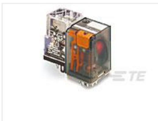
TE Part #9-1393091-7 MT326024