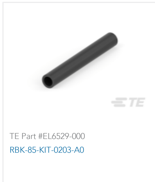
TE Part #EL6529-000 RBK-85-KIT-0203-A0