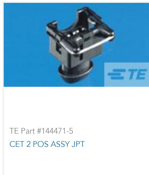
TE Part #144471-5 CET 2 POS ASSY JPT