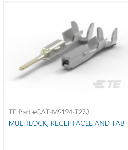
TE Part #CAT-M9194-T273 MULTILOCK, RECEPTACLE AND TAB