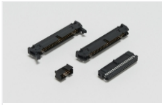
Ribbon Cable Connectors(46)