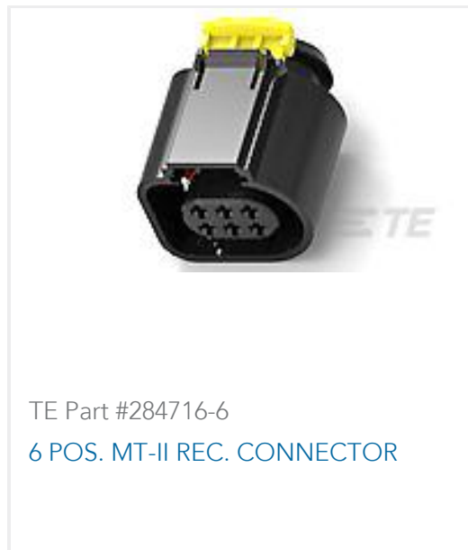
TE Part #284716-6 6 POS. MT-II REC. CONNECTOR