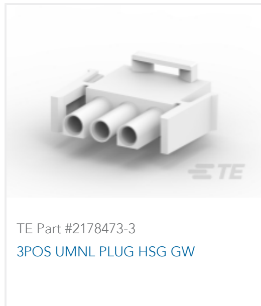
TE Part #2178473-3 3POS UMNL PLUG HSG GW