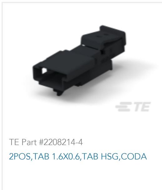
TE Part #2208214-4 2POS,TAB 1.6X0.6,TAB HSG,CODA