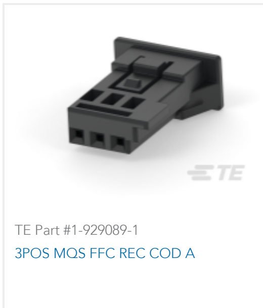
TE Part #1-929089-1 3POS MQS FFC REC COD A