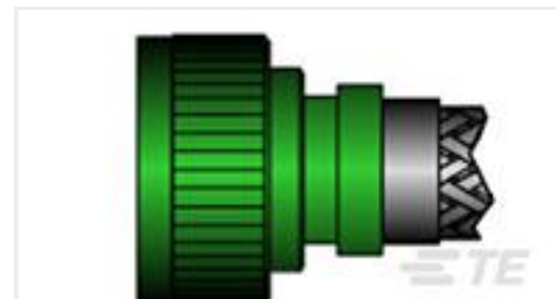
TE Part #765167-000 203M012-19B07