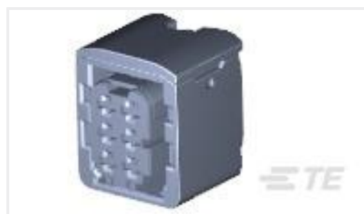
TE Part #1-1418437-1 6POS,AMP MCP2.8,REC HSG,ASSY, SEALED