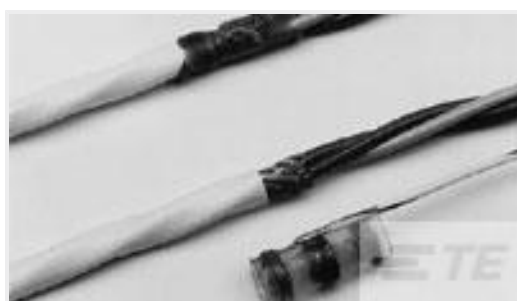
TE Part #272423-000 CWT-9