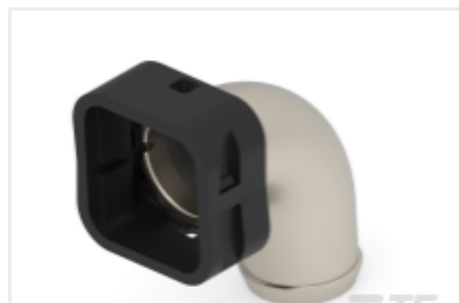
TE Part #ZPF000000000102764 787-8055-30M