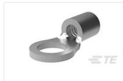
TE Part #34119 TERMINAL,SOLIS R 16-14 4