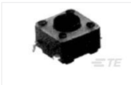
TE Part #4-1437565-1 FSM4JSMA=SMT,TACTILE,PB SWITCH