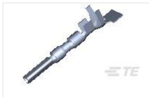
TE Part #1-794221-0 MINI UMNL2 SOK 22-18AWG AU LF