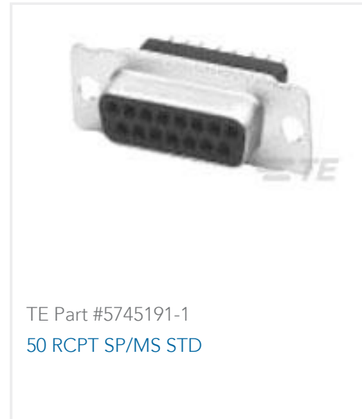
TE Part #5745191-1 50 RCPT SP/MS STD