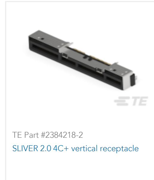
TE Part #2384218-2 SLIVER 2.0 4C+ vertical receptacle