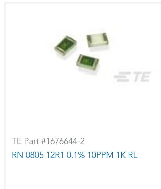
TE Part #1676644-2 RN 0805 12R1 0.1% 10PPM 1K RL