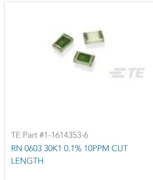
TE Part #1-1614353-6 RN 0603 30K1 0.1% 10PPM CUT LENGTH