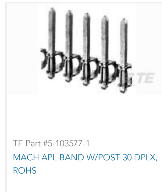
TE Part #5-103577-1 MACH APL BAND W/POST 30 DPLX, ROHS