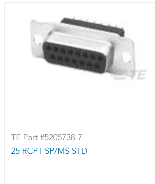
TE Part #5205738-7 25 RCPT SP/MS STD