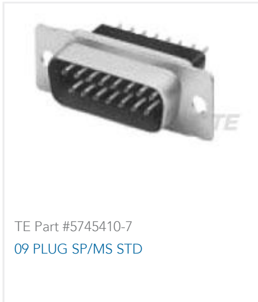
TE Part #5745410-7 09 PLUG SP/MS STD