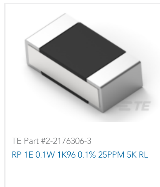
TE Part #2-2176306-3 RP 1E 0.1W 1K96 0.1% 25PPM 5K RL