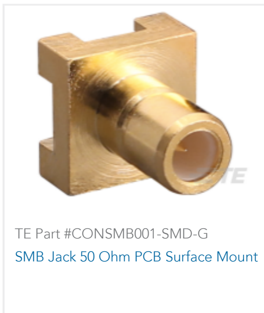
TE Part #CONSMB001-SMD-G SMB Jack 50 Ohm PCB Surface Mount