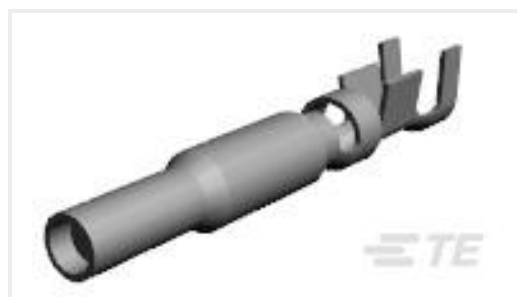
TE Part #770251-3 UMNL II SOK PTPPHBZ LP 20-14