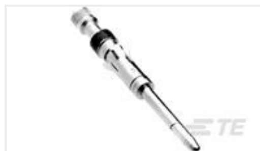
TE Part #202507-1 CONTACT PIN ASSY.