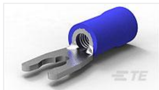
TE Part #52955 TERMINAL,PG SPR SPD 16-14 6