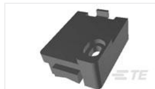
TE Part #640716-1 09P UMNL STR/REL & INSRT