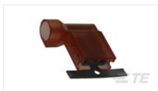
TE Part #2-520129-2 ULTRAFast 250 ASSY FLAG 22-18 TPBR LP