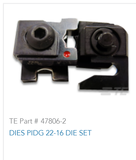
TE Part # 47806-2 DIES PIDG 22-16 DIE SET