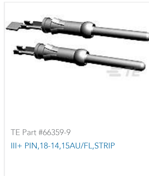
TE Part #66359-9 III+ PIN,18-14,15AU/FL,STRIP