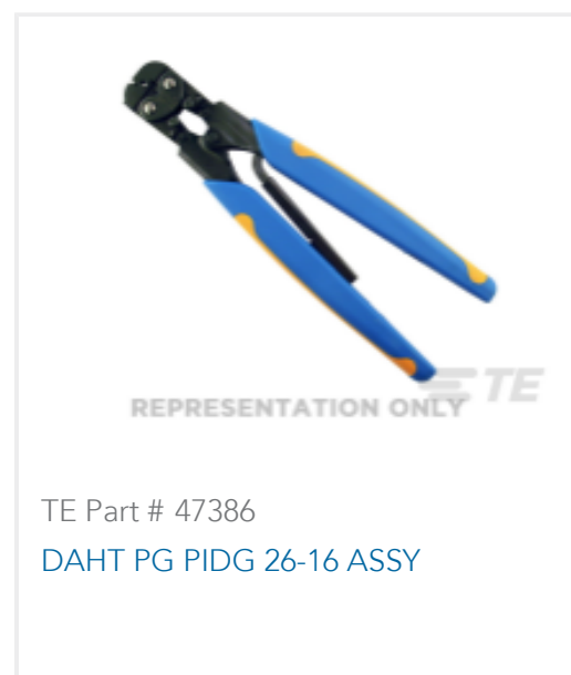
TE Part # 47386 DAHT PG PIDG 26-16 ASSY