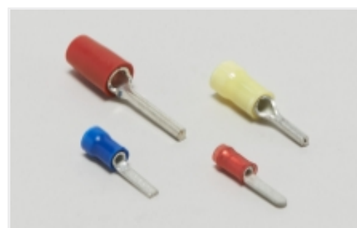
Crimp Wire Pins, Tabs & Ferrules(20)