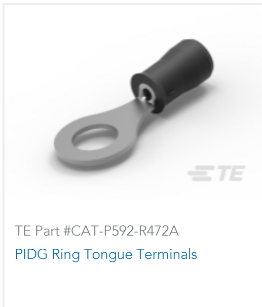
TE Part #CAT-P592-R472A PIDG Ring Tongue Terminals