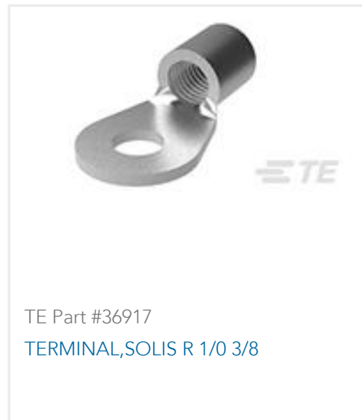
TE Part #36917 TERMINAL,SOLIS R 1/0 3/8