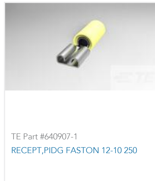
TE Part #640907-1 RECEPT,PIDG FASTON 12-10 250