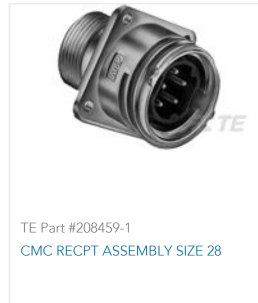
TE Part #208459-1 CMC RECPT ASSEMBLY SIZE 28