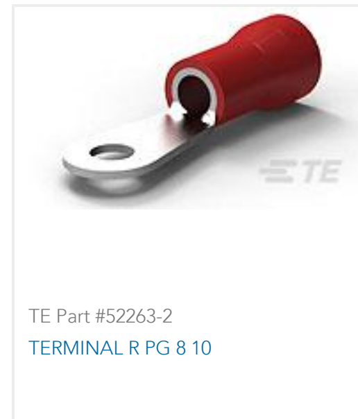
TE Part #52263-2 TERMINAL R PG 8 10