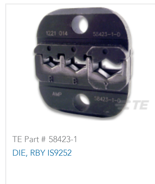
TE Part # 58423-1 DIE, RBY IS9252