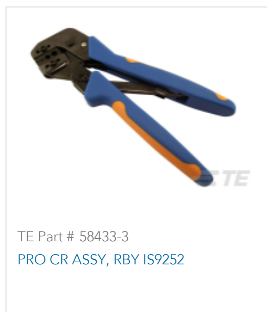
TE Part # 58433-3 PRO CR ASSY, RBY IS9252