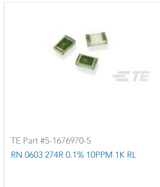
TE Part #5-1676970-5 RN 0603 274R 0.1% 10PPM 1K RL