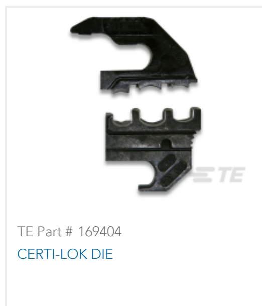
TE Part # 169404 CERTI-LOK DIE