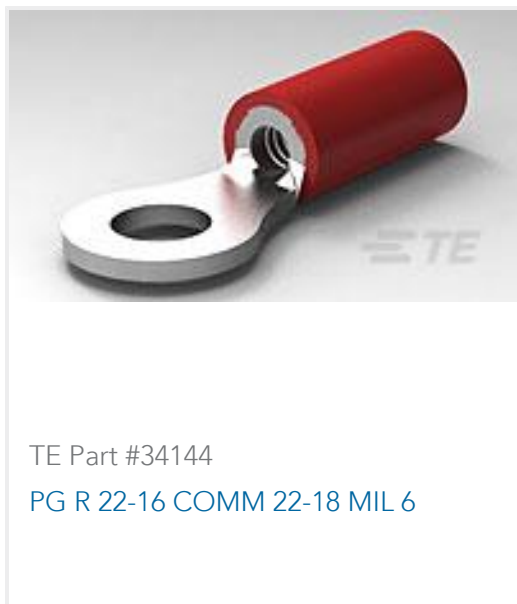
TE Part #34144 PG R 22-16 COMM 22-18 MIL 6