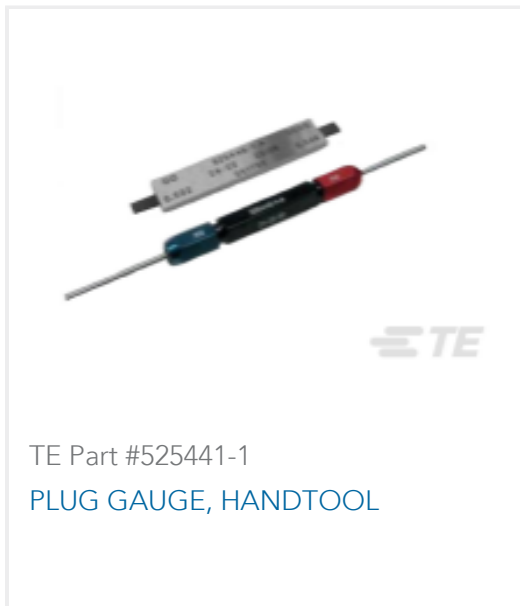
TE Part #525441-1 PLUG GAUGE, HANDTOOL