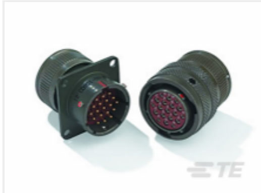
TE Part #ZPF00000000006017 951-00 E 8-3A-P 50