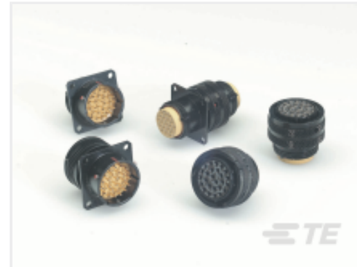
TE Part #ZPF00000000017994 FDBA 50-12-10 SN-K-A838