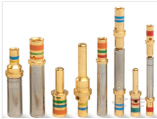
TE Part #ZPF000000000104380 548-0373-20