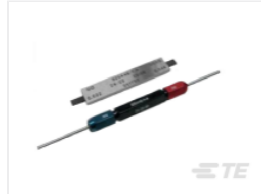
TE Part #525441-2 PLUG GAUGE, HANDTOOL