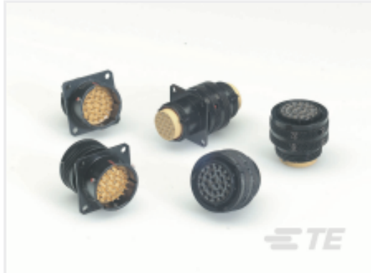
TE Part #ZPF00000000018467 FDBA 50-22-41 PN-K 090 A499