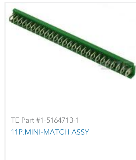
TE Part #1-5164713-1 11P.MINI-MATCH ASSY