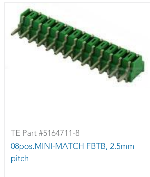
TE Part #5164711-8 08pos.MINI-MATCH FBTB, 2.5mm pitch