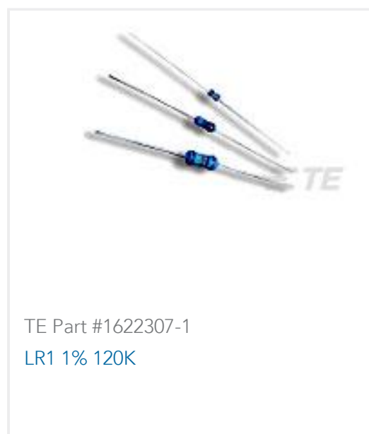
TE Part #1622307-1 LR1 1% 120K