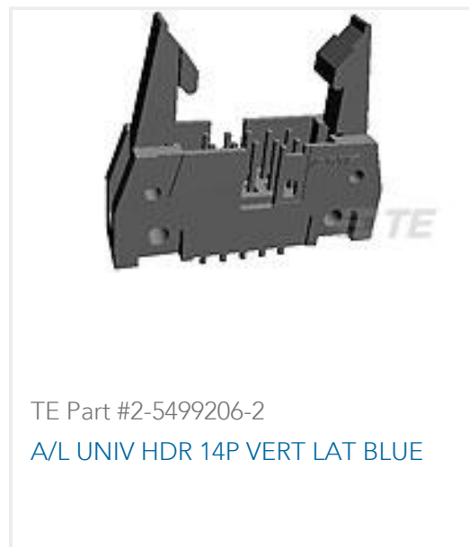
TE Part #2-5499206-2 A/L UNIV HDR 14P VERT LAT BLUE