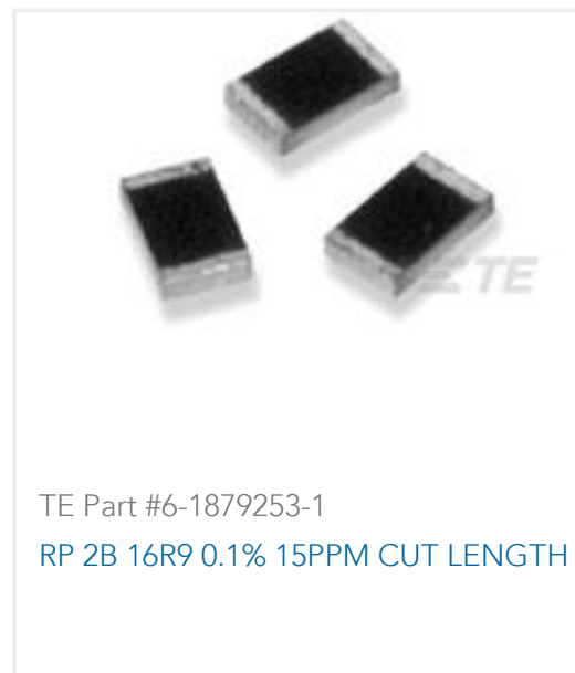
TE Part #6-1879253-1 RP 2B 16R9 0.1% 15PPM CUT LENGTH