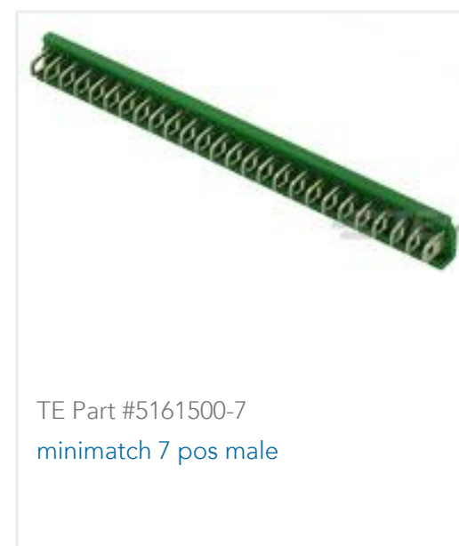
TE Part #5161500-7 minimatch 7 pos male