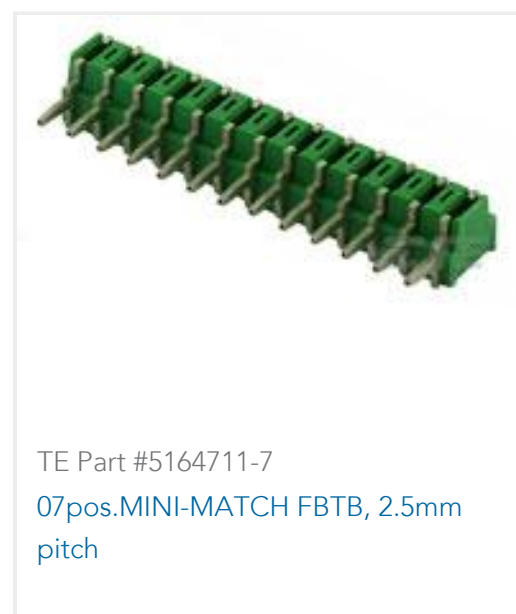
TE Part #5164711-7 07pos.MINI-MATCH FBTB, 2.5mm pitch