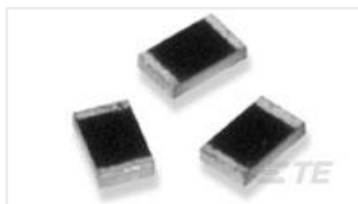
TE Part #9-1879252-5 RP 2B 10R 0.1% 15PPM 1K RL