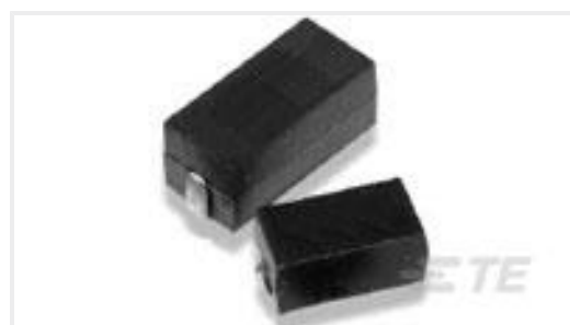
TE Part #1879234-4 SMF5 680R 5%