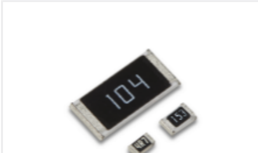
TE Part #3-2176349-8 CRGCQ 2512 12K 1%