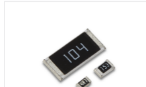
TE Part #5-2176349-3 CRGCQ 2512 220K 1%