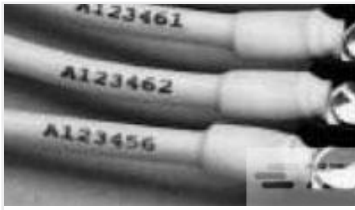
TE Part #5070062034 RNF-100-1/4-X-STK