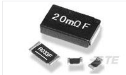
TE Part #2176117-9 TLR 1206 1.0W R008 1% 50PPM 2K RL