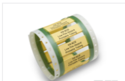
TE Part #CAT-T3437-H99 HX-SCE Low Fire Hazard Sleeves