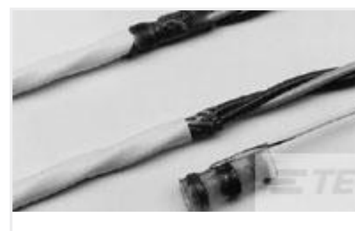
TE Part #270225-000 B-150-07