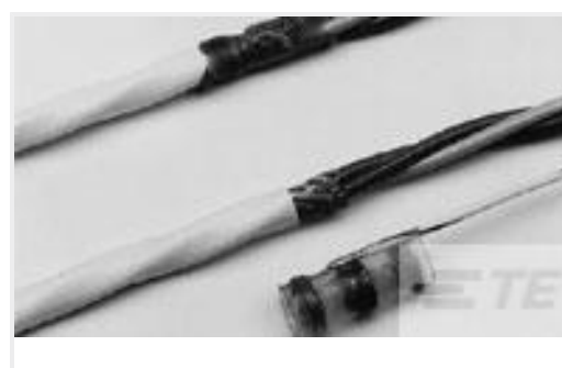
TE Part #176819-000 B-150-11