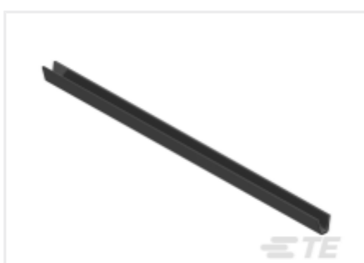
TE Part #CAT-HST-RAYRIM RAYRIM Heat Shrink Tubing