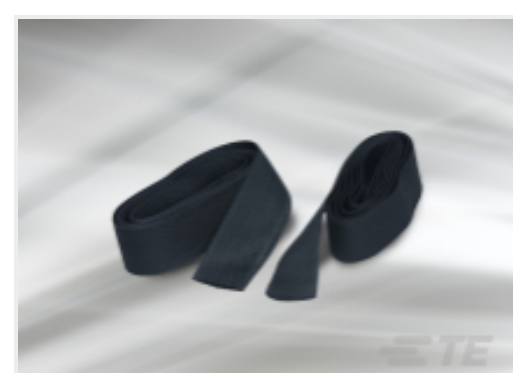
TE Part #CAT-HST-HFT5000 HFT5000 Heat Shrink Tubing