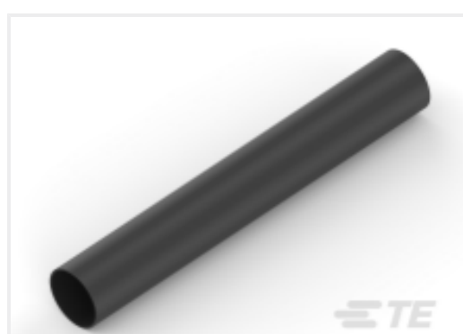
TE Part #CAT-HST-GPO135 GPO-135 Heat Shrink Tubing