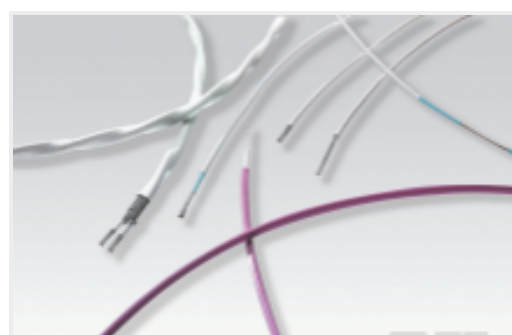
TE Part #CQ70803001 55E0119-0.75-4(NS)