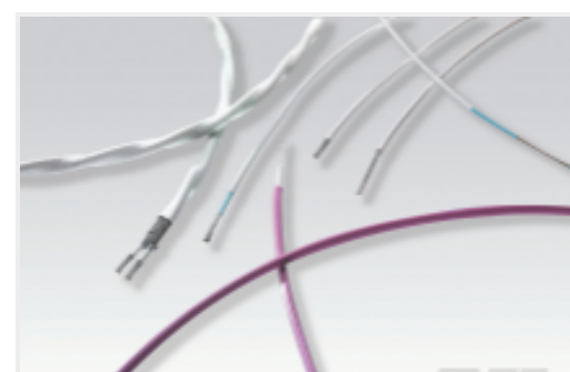
TE Part #CT61503001 55E0119-0.75-0(NS)