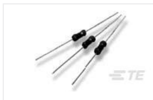
TE Part #8-1625890-0 2W SM M/OX 5% 820K