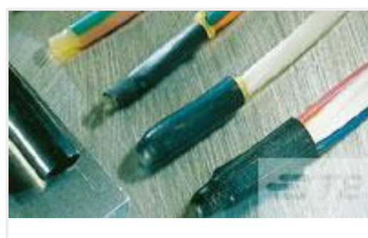
TE Part #EG41010001 ES-CAP-NO.1-C1-0-50MM