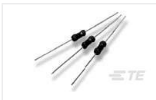
TE Part #3-1879353-4 RR02 5% 100K AMMO