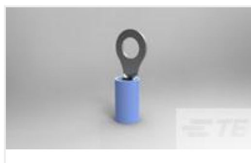
TE Part #130094 PIDG RING