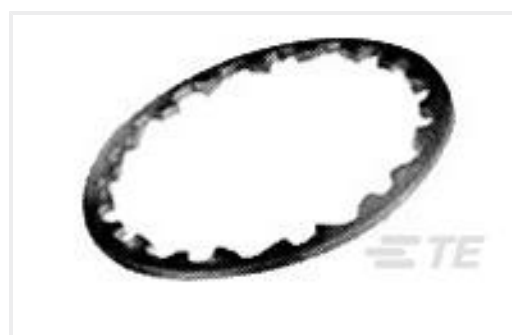
TE Part #1-329632-2 LOCKWASHER, PLATED