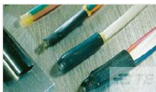
TE Part #EG41010001 ES-CAP-NO.1-C1-0-50MM