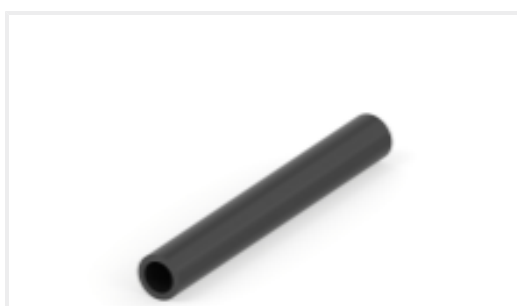
TE Part #CAT-HST-QSZH QSZH Heat Shrink Tubing