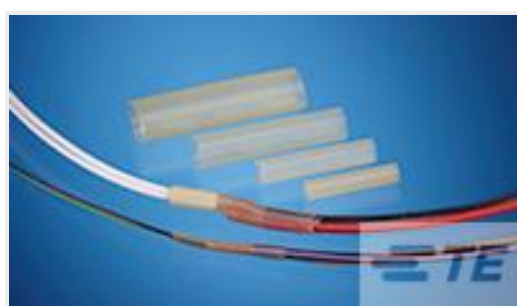
TE Part #3157736003 RBK-VWS-125-NR4-X-50MM