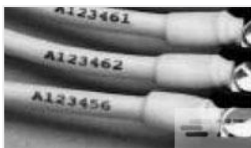
TE Part #5053254020 RNF-100-3/4-2-SP