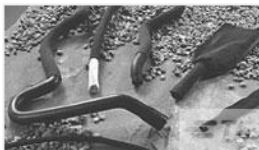
TE Part #7480624003 HFT5000-70/35-0-SP