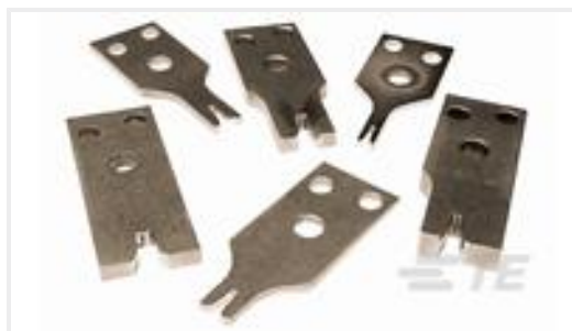
TE Part #1-1752057-4 CRIMPER, WIRE, STEPPED (.062)