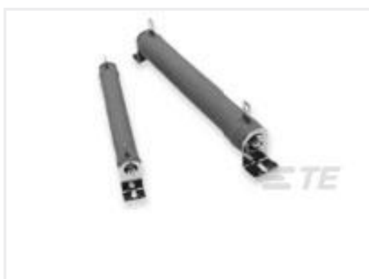
TE Part #1-1879447-7 TE 200W 22R 5% Bracket