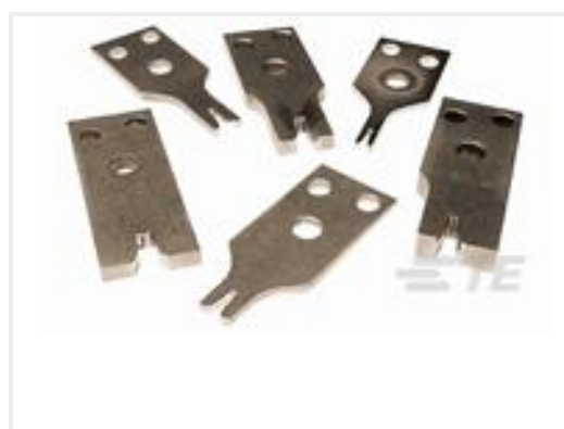
TE Part #1752766-1 CRIMPER, INSULATION,SP(.072)