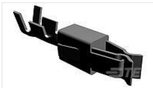
TE Part #2-964284-1 JPT A REC 2.8 Contact SRC Au