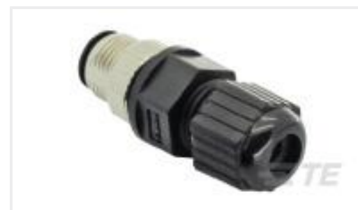
TE Part #1838275-4 M12 Fld Ser CONN. Male Pin Sldr