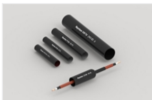
Power Cable Tubing & Accessories(5)