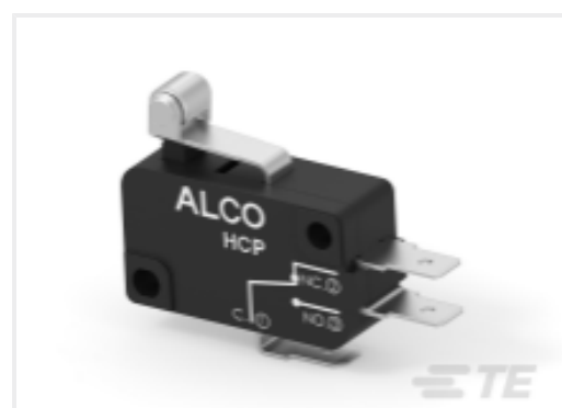
TE Part #2-2439028-3 HCP10A, Lgt Force,0.187 Term. Sht Roller