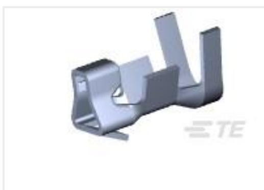
TE Part #1376476-1 2.5 SIGNAL MATE REC CONTACT