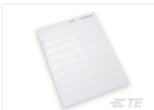
TE Part #CAT-T3437-C8906 CSL Self Laminating Polyester Labels