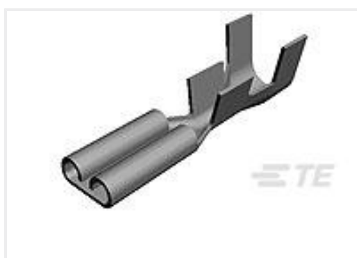
TE Part #342368-1 187 FASTON,REC.,30-24 AWG,BR