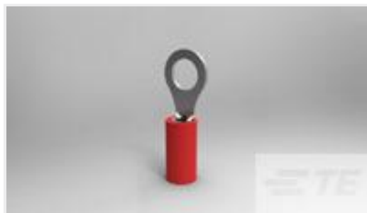
TE Part #2-36153-2 PIDG R 22-16 COMM 22-18 MIL 10