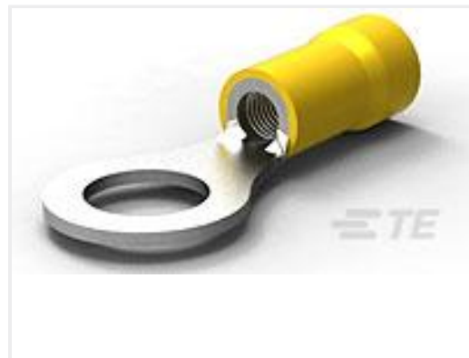
TE Part #34856 TERMINAL,PG R 12-10 5/16