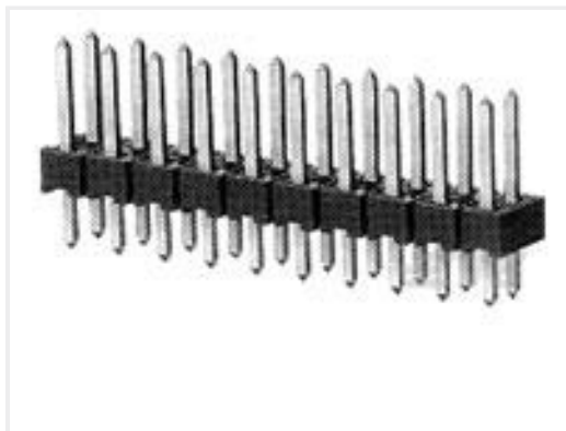
TE Part #826925-2 2P MOD2 STIFT LEI