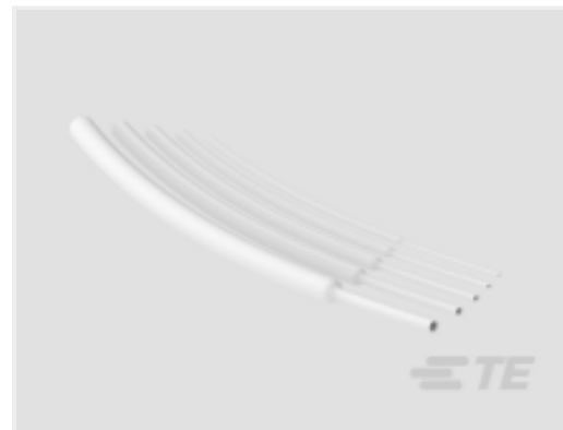
TE Part #CAT-HST-RNF100-2 RNF-100-2 Heat Shrink Tubing