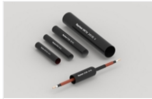
Power Cable Tubing & Accessories(5)