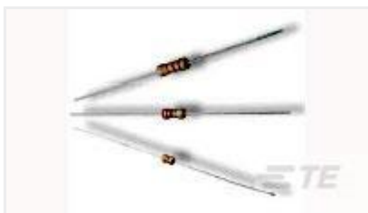
TE Part #1623928-6 CFR16 5% 33K