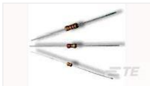
TE Part #6-1623930-8 CFR25 5% 2K7