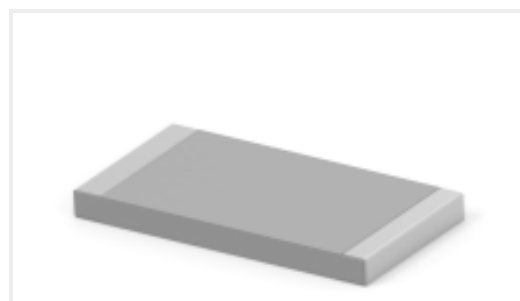
TE Part #3-2176331-3 CRGP 2512 4K7 1%