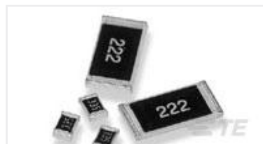
TE Part #1622866-1 CRG0603 1% 1K0