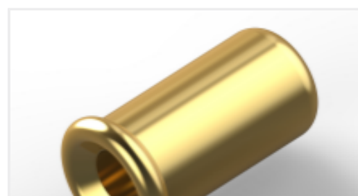
TE Part #CAT-377-MSSOB4 Miniature Spring Sockets: Open Bottom, Beryllium Copper, 6.5A