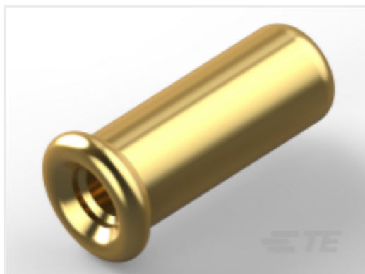
TE Part # CAT-377-MSSCB4 Miniature Spring Sockets: Closed Bottom, Beryllium Copper, 4A