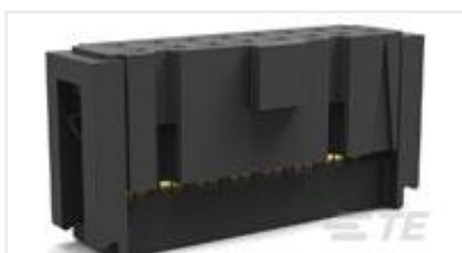
TE Part #2-1658527-0 622-1230LF=FSKT IDC S 12 30AU