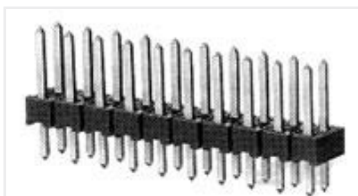
TE Part #826632-2 2P AMPMODU II PIN HDR