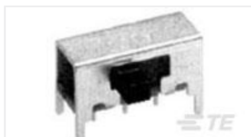
TE Part #1825232-1 SLIDE SWITCH,SPDT,Right Angle