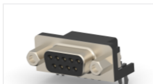
TE Part #2311765-1 AMPL REC, HD20, R/A, 9P, S/L, .318