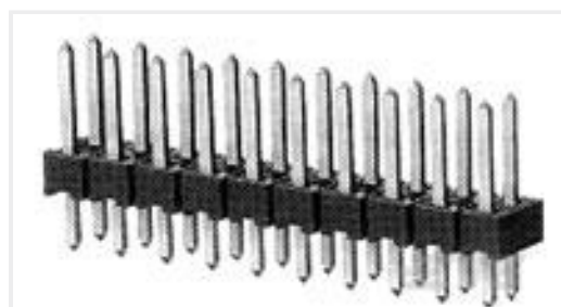
TE Part #826632-7 7P AMPMODU II PIN HDR.