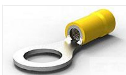
TE Part #34173 TERMINAL,PG R 12-10 3/8