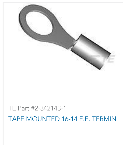
TE Part #2-342143-1 TAPE MOUNTED 16-14 F.E. TERMIN