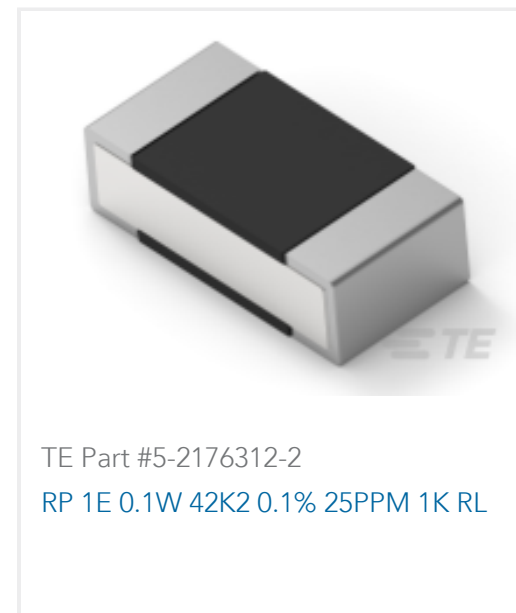
TE Part #5-2176312-2 RP 1E 0.1W 42K2 0.1% 25PPM 1K RL