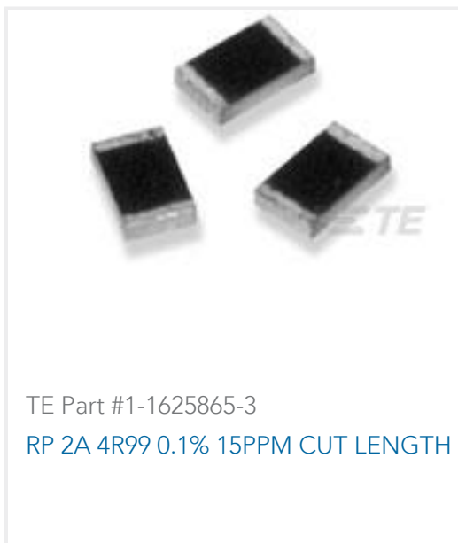
TE Part #1-1625865-3 RP 2A 4R99 0.1% 15PPM CUT LENGTH