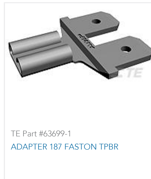
TE Part #63699-1 ADAPTER 187 FASTON TPBR