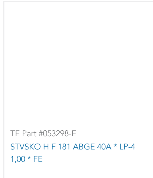
TE Part #053298-E STVSKO H F 181 ABGE 40A * LP-4 1,00 * FE