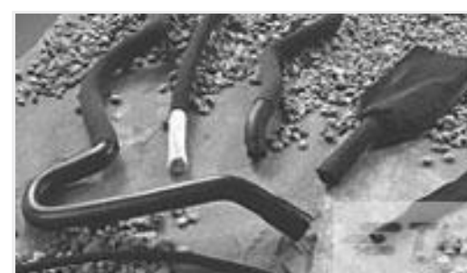
TE Part #F944854003 HFT5000-6/3-0-SP