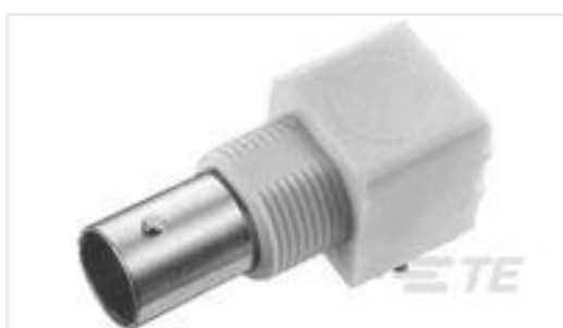
TE Part #5227161-6 RTANG JK W/MTG PINS, BNC PCB