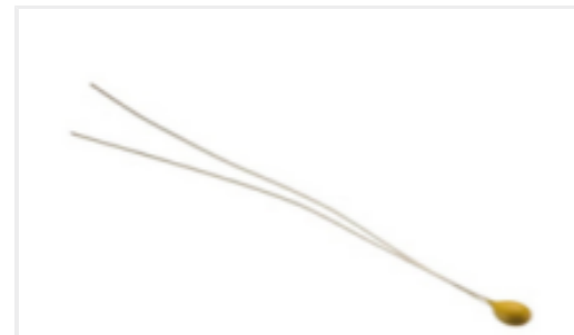
TE Part #GA10K3A1AM DISCRETE 10K, +/-0.05C FROM 32C to 44C