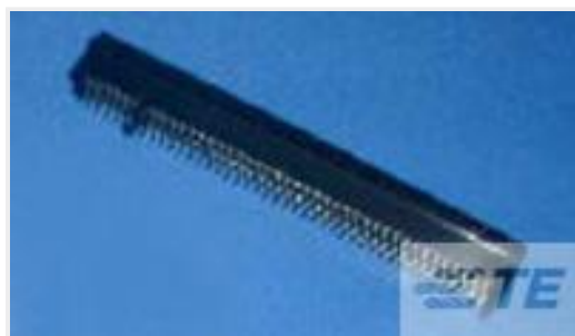
TE Part # 1734774-1 PCI EXP 3.1L 36 POS WHT G/F