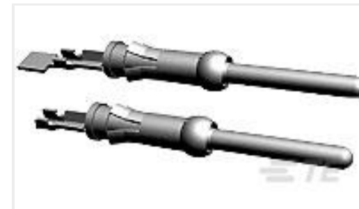
TE Part #213603-3 5015 PIN, 18-14, 30AU DUP, STRIP