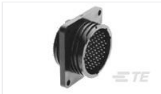
TE Part #1-208657-0 CPC RECEPT ASSEMBLY SIZE 11-8