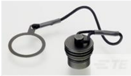
TE Part #2101579-2 DUST CAP,RCPT,Sz105,F SERIES