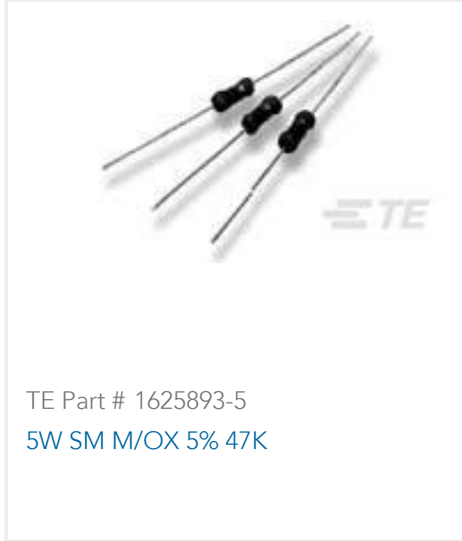
TE Part # 1625893-5 5W SM M/OX 5% 47K