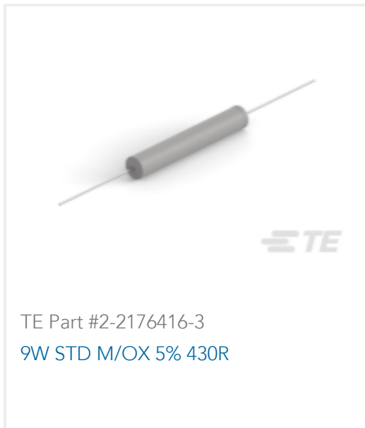
TE Part #2-2176416-3 9W STD M/OX 5% 430R