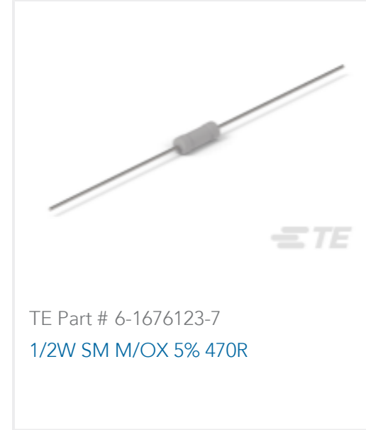
TE Part # 6-1676123-7 1/2W SM M/OX 5% 470R