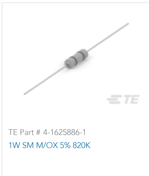
TE Part # 4-1625886-1 1W SM M/OX 5% 820K