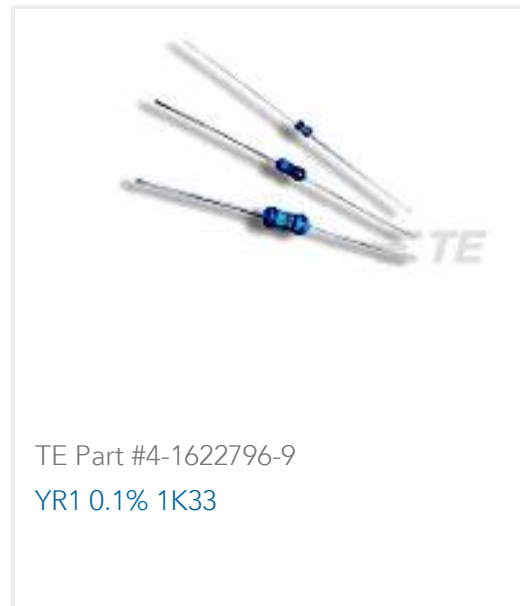
TE Part #4-1622796-9 YR1 0.1% 1K33