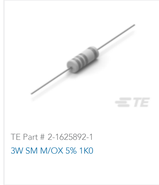
TE Part # 2-1625892-1 3W SM M/OX 5% 1K0