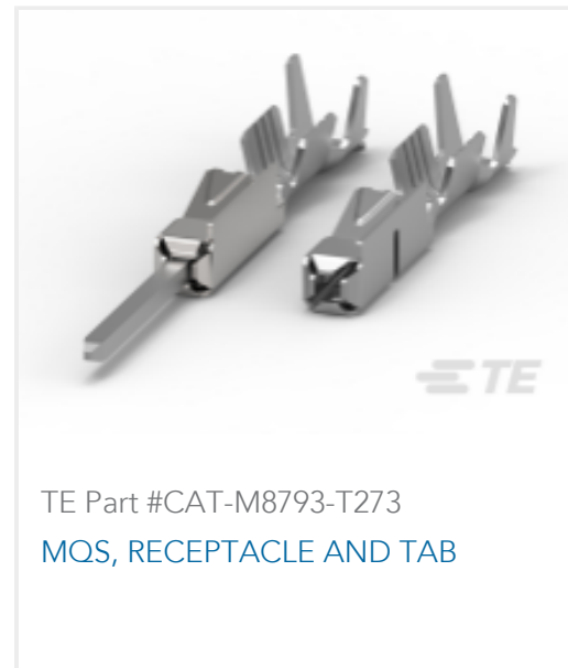
TE Part #CAT-M8793-T273 MQS, RECEPTACLE AND TAB