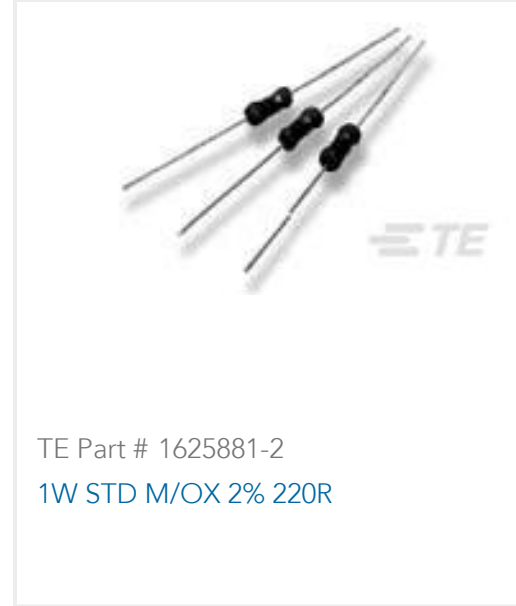
TE Part # 1625881-2 1W STD M/OX 2% 220R