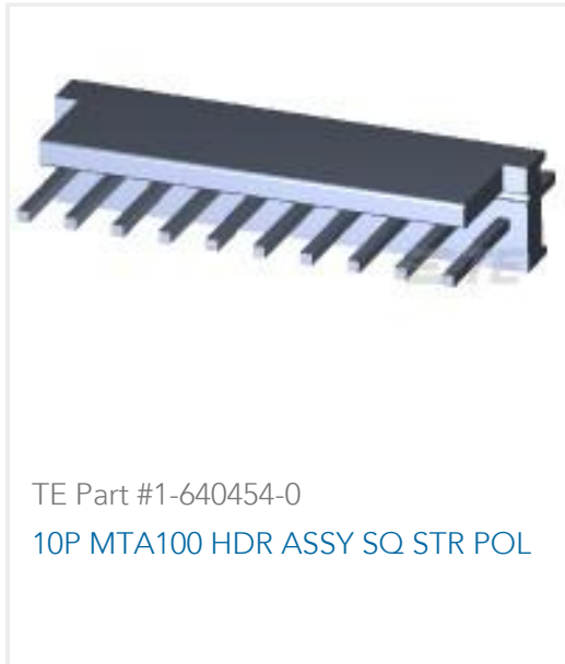
TE Part #1-640454-0 10P MTA100 HDR ASSY SQ STR POL