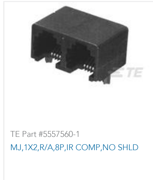
TE Part #5557560-1 MJ,1X2,R/A,8P,IR COMP,NO SHLD