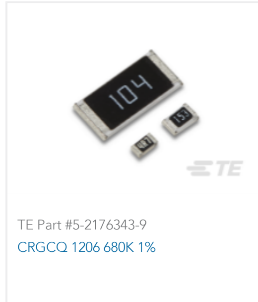
TE Part #5-2176343-9 CRGCQ 1206 680K 1%