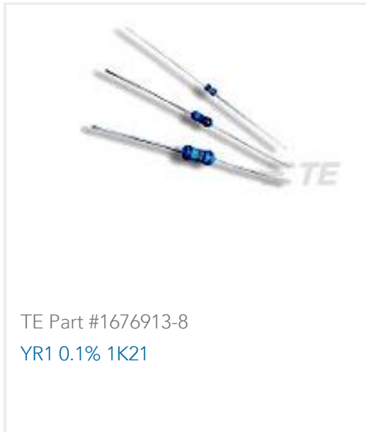
TE Part #1676913-8 YR1 0.1% 1K21