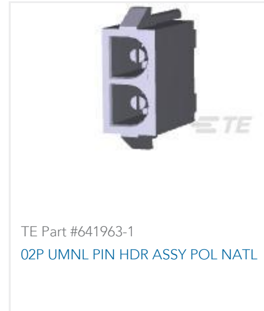
TE Part #641963-1 02P UMNL PIN HDR ASSY POL NATL