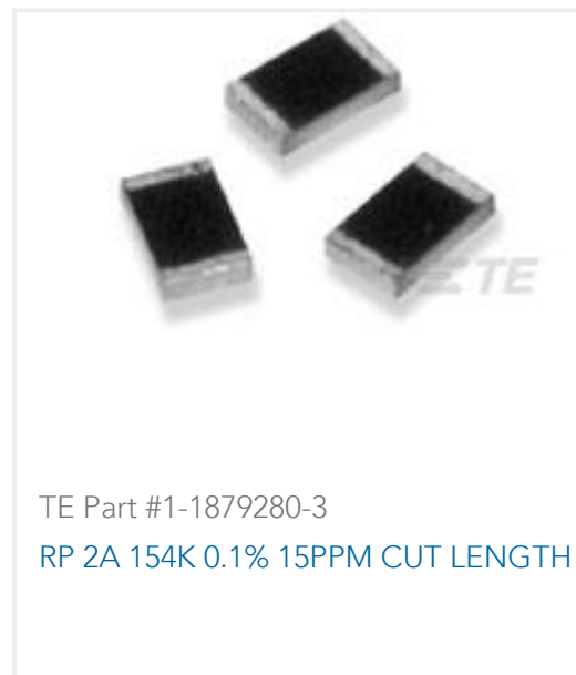
TE Part #1-1879280-3 RP 2A 154K 0.1% 15PPM CUT LENGTH