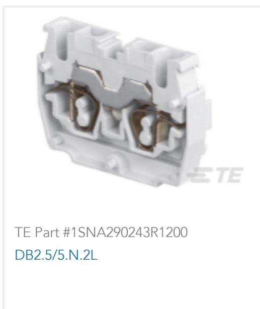
TE Part #1SNA290243R1200 DB2.5/5.N.2L