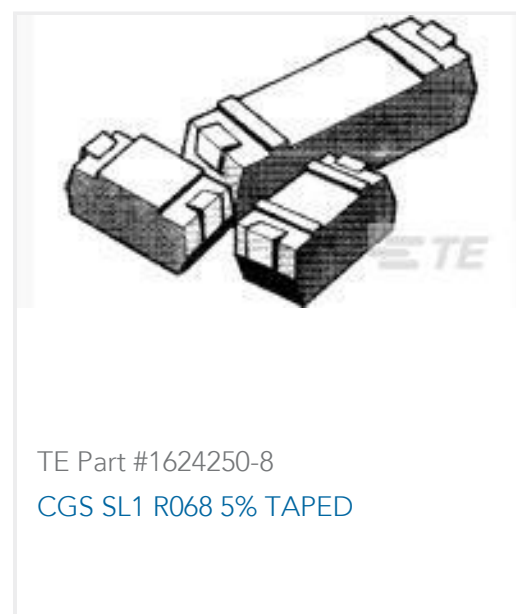
TE Part #1624250-8 CGS SL1 R068 5% TAPED