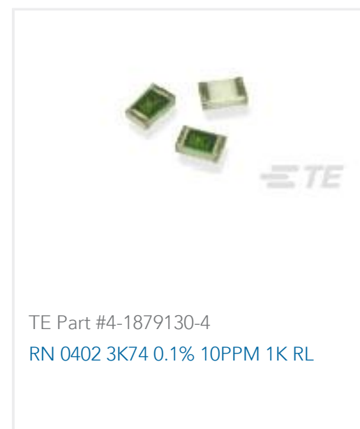
TE Part #4-1879130-4 RN 0402 3K74 0.1% 10PPM 1K RL