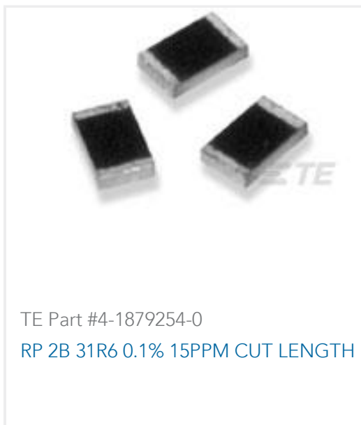
TE Part #4-1879254-0 RP 2B 31R6 0.1% 15PPM CUT LENGTH