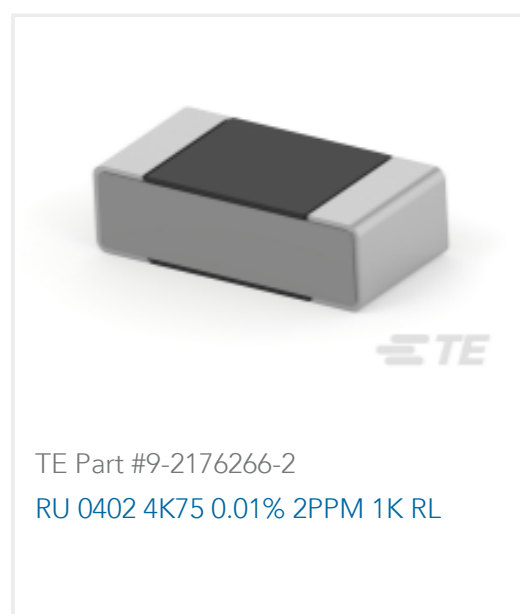
TE Part #9-2176266-2 RU 0402 4K75 0.01% 2PPM 1K RL