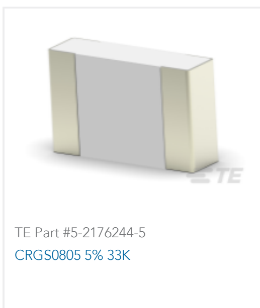
TE Part #5-2176244-5 CRGS0805 5% 33K