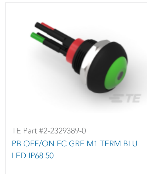
TE Part #2-2329389-0 PB OFF/ON FC GRE M1 TERM BLU LED IP68 50