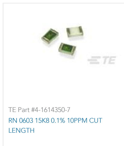
TE Part #4-1614350-7 RN 0603 15K8 0.1% 10PPM CUT LENGTH