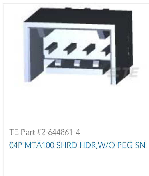
TE Part #2-644861-4 04P MTA100 SHRD HDR,W/O PEG SN