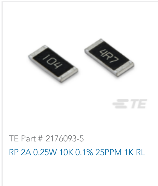
TE Part # 2176093-5 RP 2A 0.25W 10K 0.1% 25PPM 1K RL