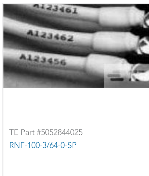
TE Part #5052844025 RNF-100-3/64-0-SP