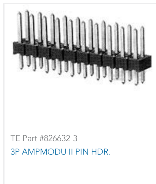
TE Part #826632-3 3P AMPMODU II PIN HDR