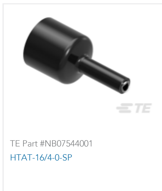
TE Part #NB07544001 HTAT-16/4-0-SP