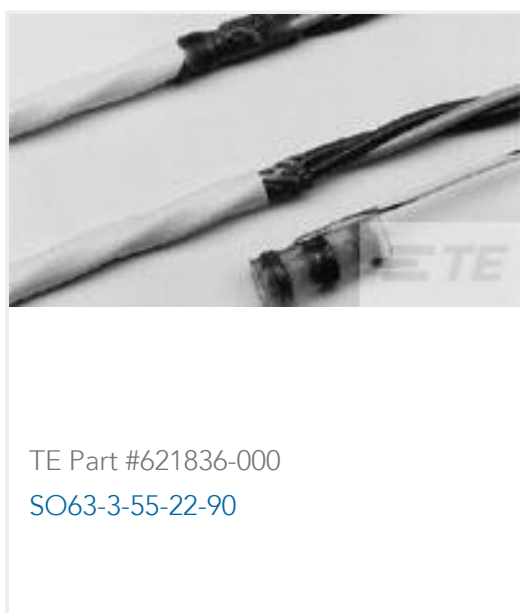
TE Part #621836-000 SO63-3-55-22-90