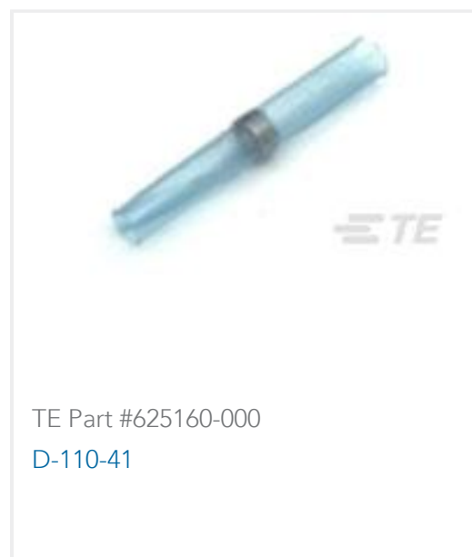
TE Part #625160-000 D-110-41