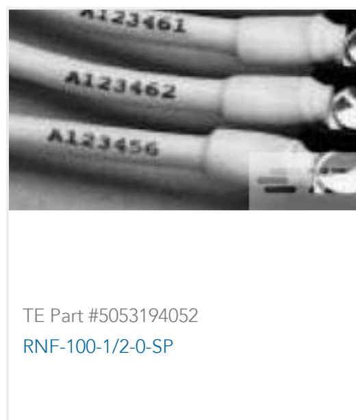
TE Part #5053194052 RNF-100-1/2-0-SP