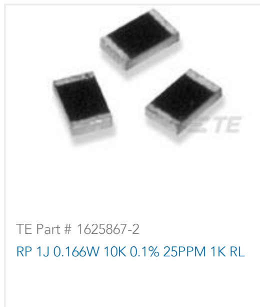
TE Part # 1625867-2 RP 1J 0.166W 10K 0.1% 25PPM 1K RL