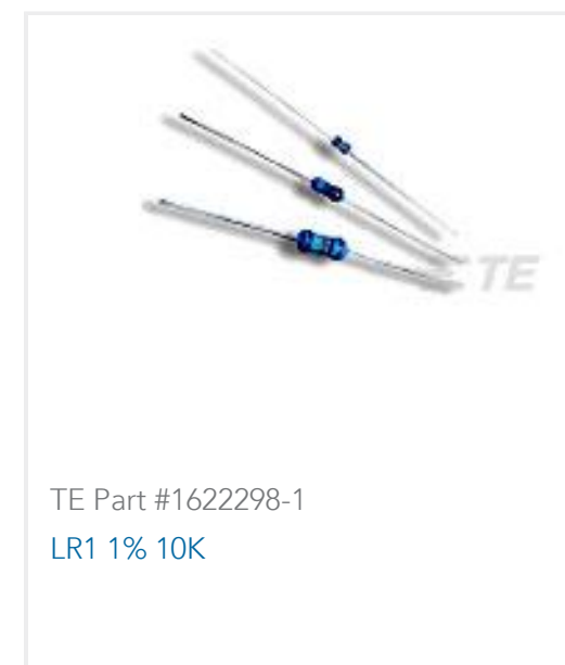
TE Part #1622298-1 LR1 1% 10K