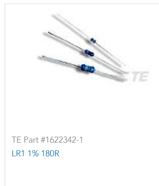
TE Part #1622342-1 LR1 1% 180R