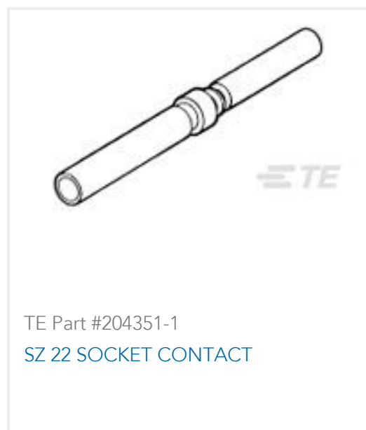
TE Part #204351-1 SZ 22 SOCKET CONTACT