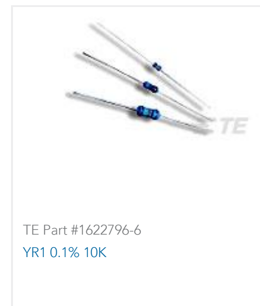
TE Part #1622796-6 YR1 0.1% 10K