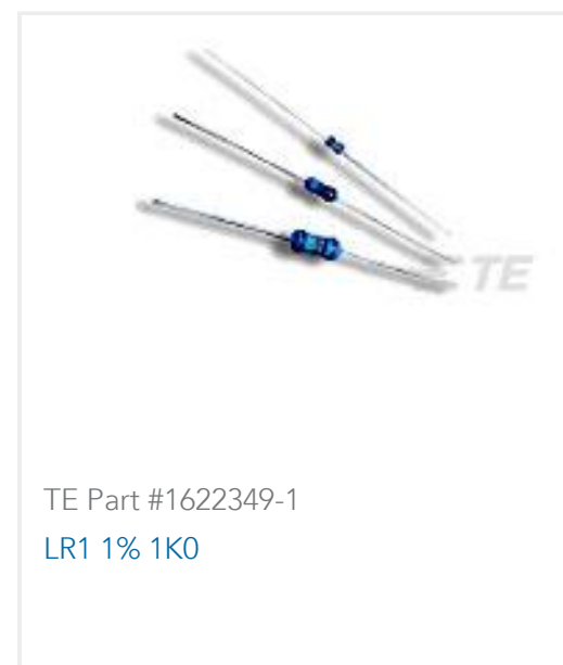
TE Part #1622349-1 LR1 1% 1K0