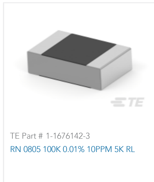
TE Part # 1-1676142-3 RN 0805 100K 0.01% 10PPM 5K RL