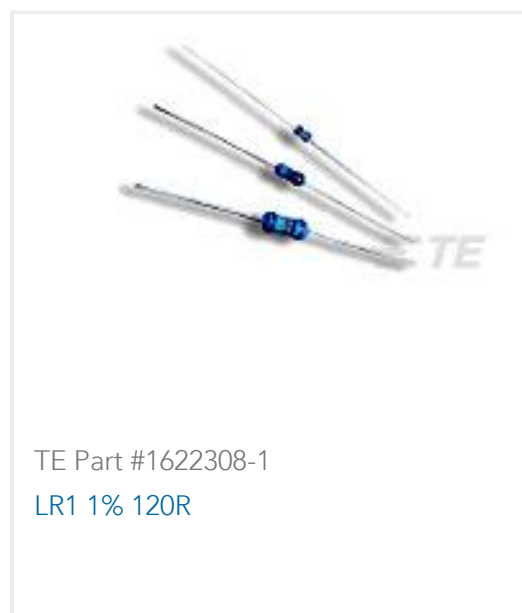
TE Part #1622308-1 LR1 1% 120R