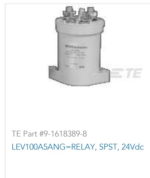
TE Part #9-1618389-8 LEV100A5ANG=RELAY, SPST, 24Vdc