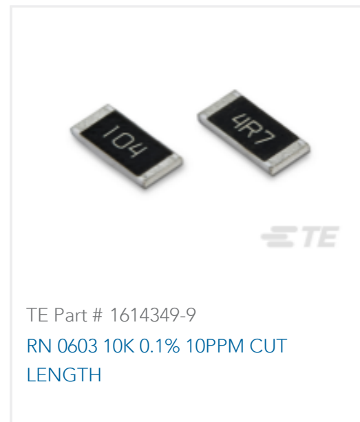
TE Part # 1614349-9 RN 0603 10K 0.1% 10PPM CUT LENGTH