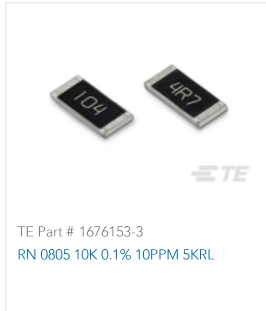
TE Part # 1676153-3 RN 0805 10K 0.1% 10PPM 5KRL