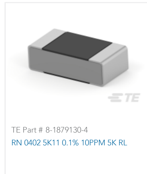
TE Part # 8-1879130-4 RN 0402 5K11 0.1% 10PPM 5K RL