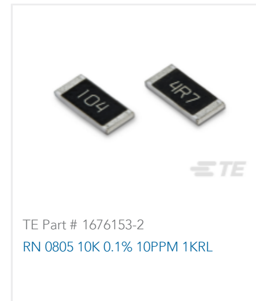
TE Part # 1676153-2 RN 0805 10K 0.1% 10PPM 1KRL