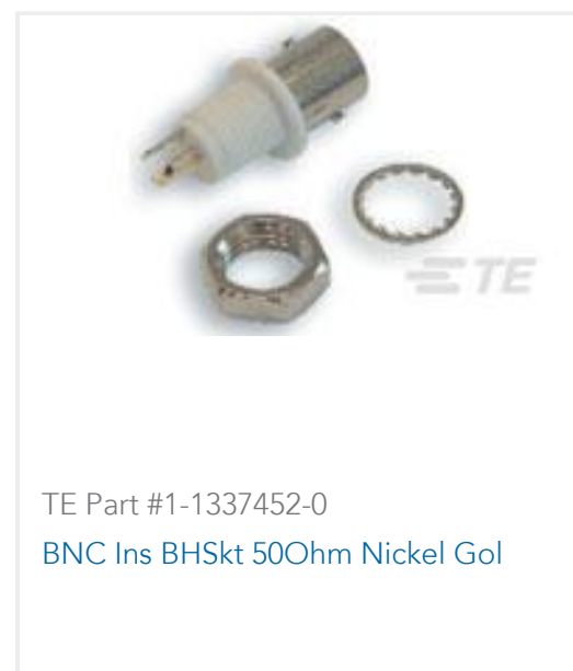
TE Part #1-1337452-0 BNC Ins BHSkt 50Ohm Nickel Gol