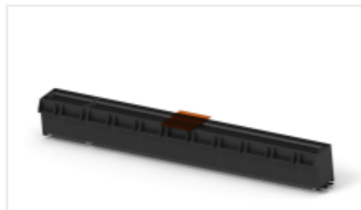
TE Part # 5-2337939-4 PCIE GEN4 CON,SMT,164POS,30u\", MYLAR,HT