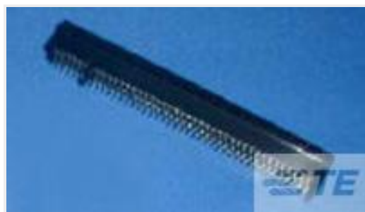
TE Part # 1734774-1 PCI EXP 3.1L 36 POS WHT G/F