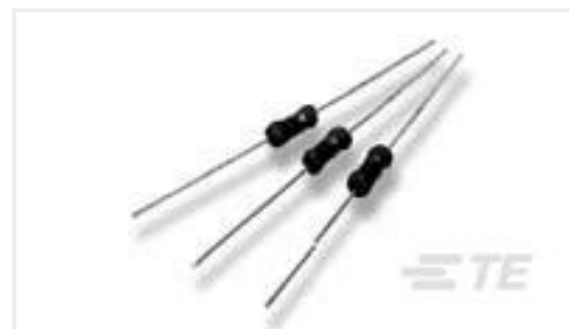
TE Part #6-1625892-1 3W SM M/OX 5% 5K6