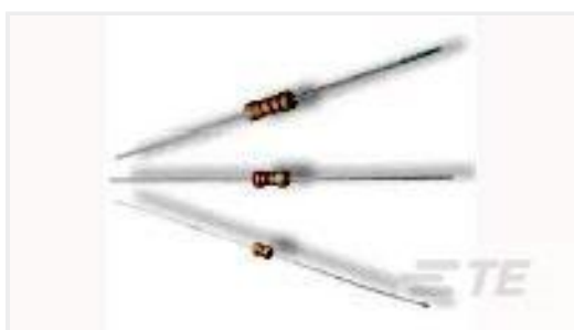
TE Part #1-1623930-0 CFR25 5% 120R