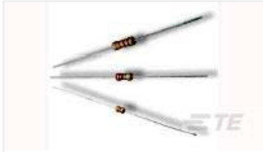
TE Part # 1623930-3 CFR25 5% 10K