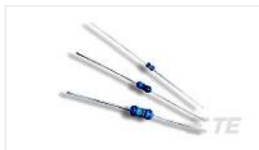
TE Part #1622473-8 LR1 1% 422R