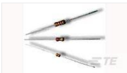
TE Part #1623931-9 CFR25 5% 33R