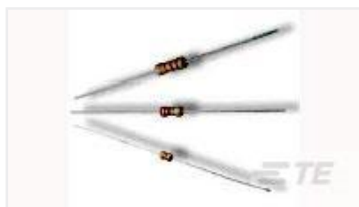
TE Part #1-1623928-1 CFR16 5% 390R