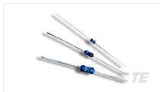
TE Part #1622207-1 LR0204 1% 27R