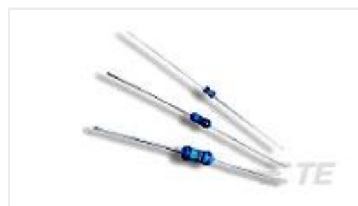
TE Part #1614984-1 LR0204 1% 11R