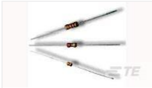
TE Part # 1623927-8 CFR16 5% 120R