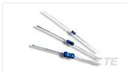
TE Part #1622165-1 LR0204 1% 15R