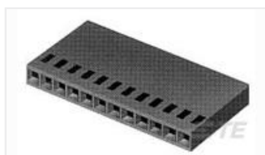
TE Part #7-87499-2 01 MODIV HSG COMP SR .100CL