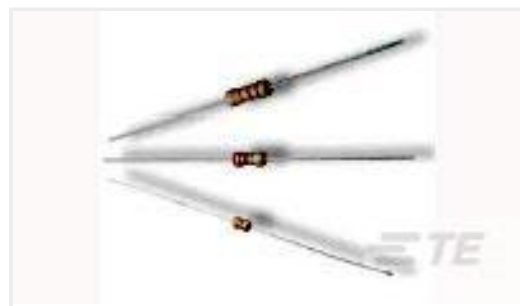
TE Part # 1623932-8 CFR50 5% 10K