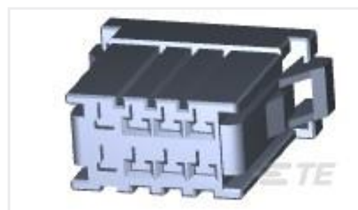
TE Part #178289-4 DYNAMIC D-3100D REC HSG 8P