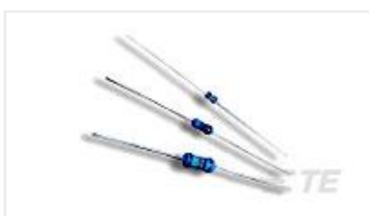
TE Part #1622552-1 LR1 1% 6K2