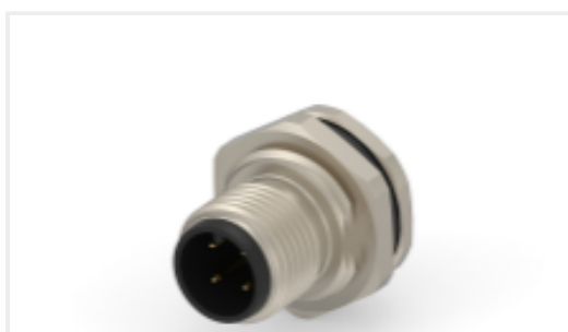
TE Part #T4171010004-001 M12,REAR MOUNTING,MALE,A,4P,0.2 M WIRE