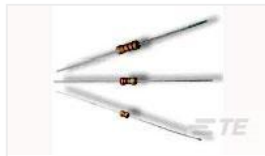
TE Part # 2-1623929-2 CFR200 5% 22K