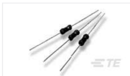
TE Part #1625890-4 2W SM M/OX 5% 100R