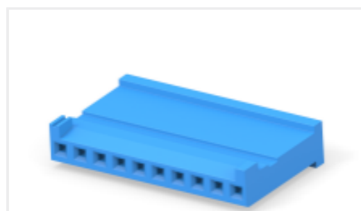
TE Part #CAT-AM74-H3401F HE13/HE14 Crimp Housings