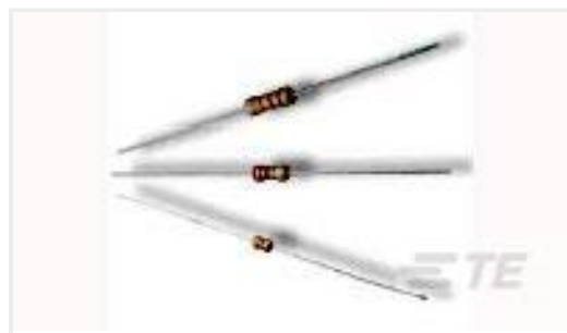
TE Part # 1623927-8 CFR16 5% 120R