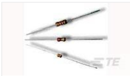
TE Part # 1623930-3 CFR25 5% 10K