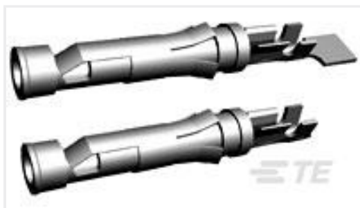
TE Part #66109-4 III+ SKT,26-24,30AU/FL,LP