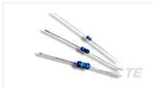
TE Part #1622298-1 LR1 1% 10K