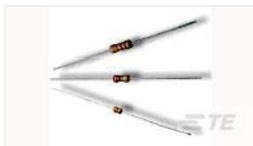
TE Part #5-1623929-8 CFR200 5% 6K8