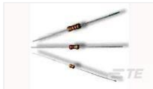
TE Part #3-1623929-7 CFR200 5% 3K3