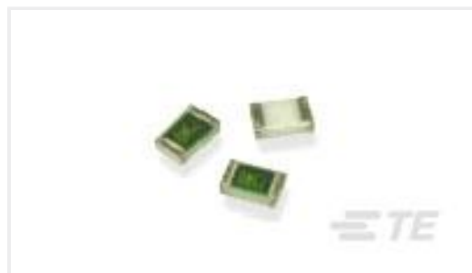
TE Part #1676255-2 RN 0805 221R 0.1% 10PPM 1KRL