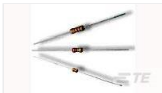
TE Part #3-1623932-9 CFR50 5% 1K2