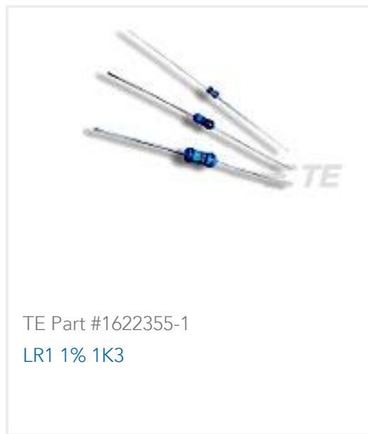
TE Part #1622355-1 LR1 1% 1K3