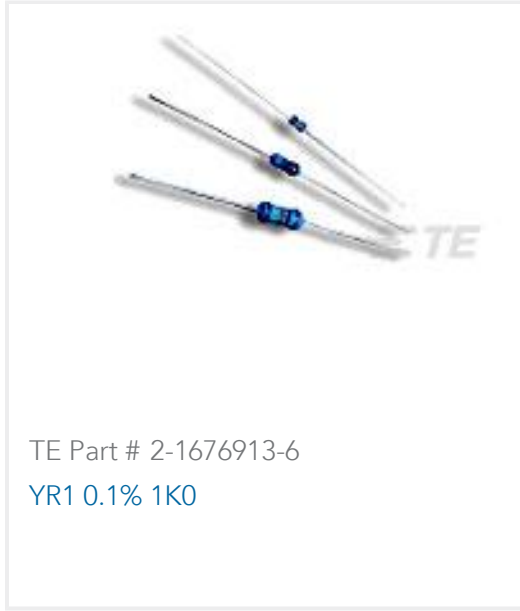
TE Part # 2-1676913-6 YR1 0.1% 1K0