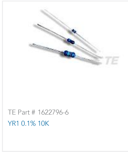
TE Part # 1622796-6 YR1 0.1% 10K