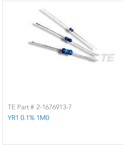
TE Part # 2-1676913-7 YR1 0.1% 1M0