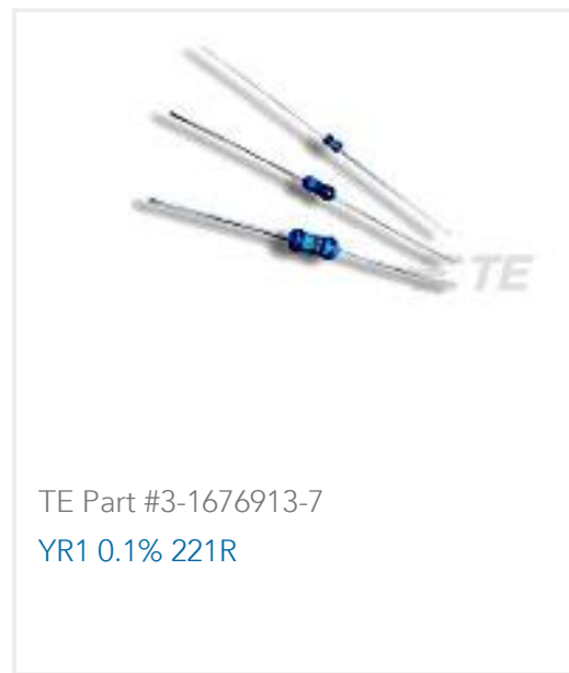
TE Part #3-1676913-7 YR1 0.1% 221R