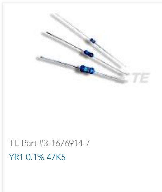
TE Part #3-1676914-7 YR1 0.1% 47K5