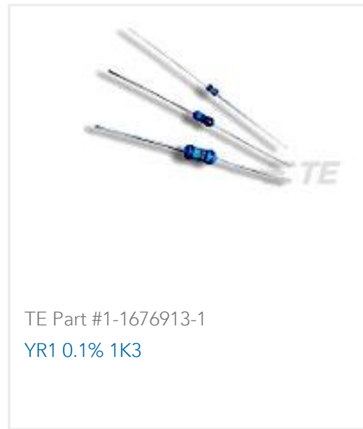
TE Part #1-1676913-1 YR1 0.1% 1K3