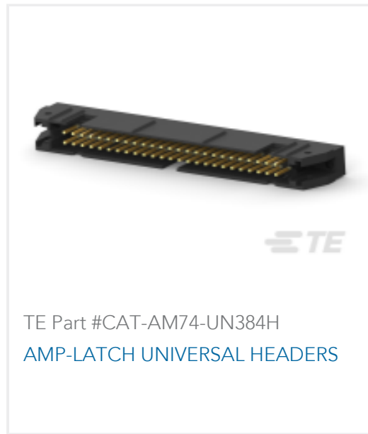
TE Part #CAT-AM74-UN384H AMP-LATCH UNIVERSAL HEADERS