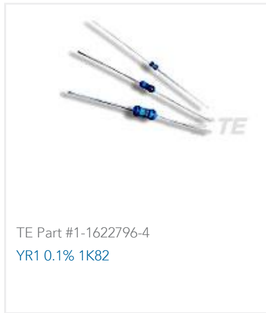
TE Part #1-1622796-4 YR1 0.1% 1K82