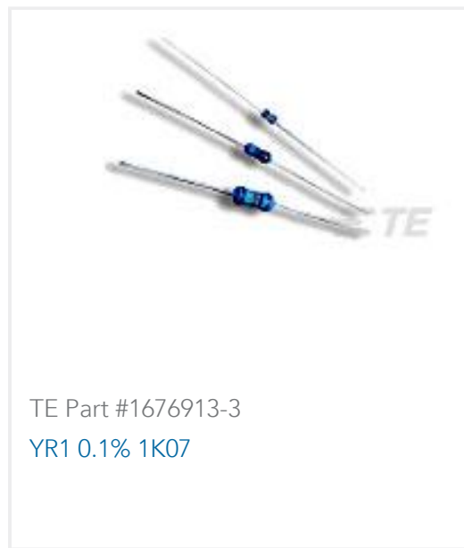
TE Part #1676913-3 YR1 0.1% 1K07