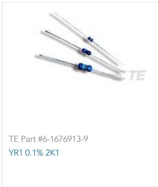
TE Part #6-1676913-9 YR1 0.1% 2K1