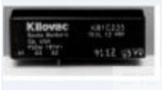
TE Part # 1-1618222-9 AP5A335=RELAY, VACUUM, SPST-NO