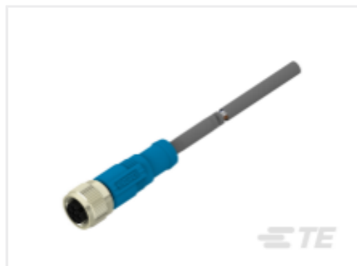
TE Part #CAT-SE594-M1FF M12 A-Code Pigtail, Female, Straight, Single End Cable