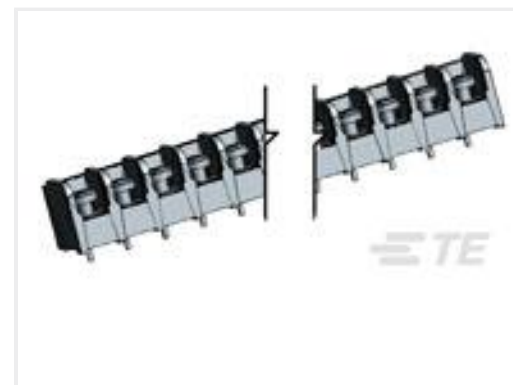
TE Part #4-1437658-0 8PCV-11-006=8PCV