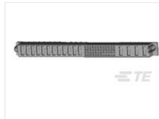
TE Part #6450860-2 MBXLE VERT RCPT 4ACP + 48S + 1