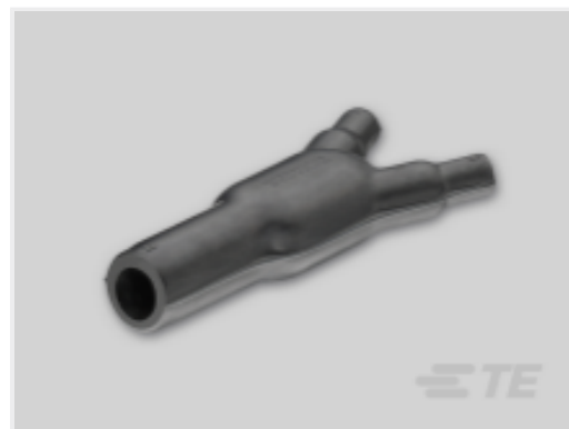
TE Part #163549-000 382A034-25/42-0