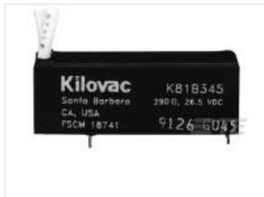
TE Part #3-1618241-3 K81B345=RELAY, VACUUM, SPST-NC