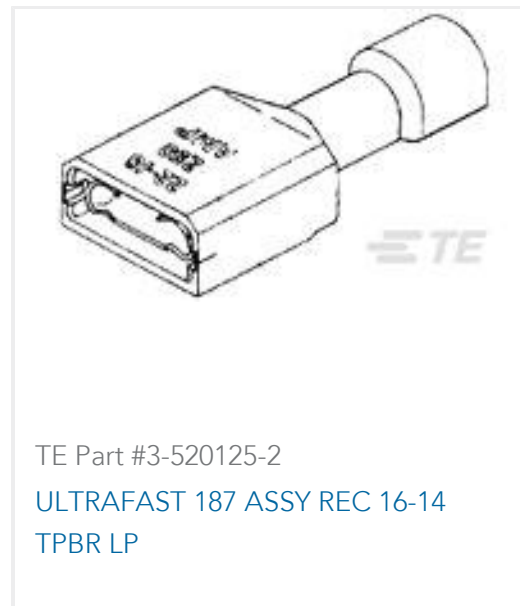
TE Part #3-520125-2 ULTRAFast 187 ASSY REC 16-14 TPBR LP