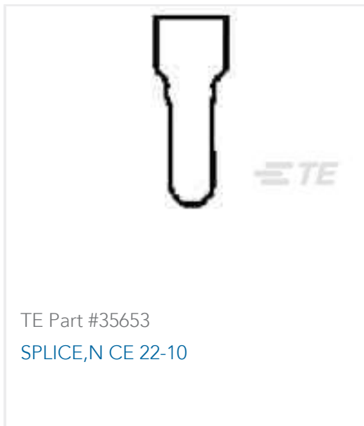
TE Part #35653 SPLICE,N CE 22-10